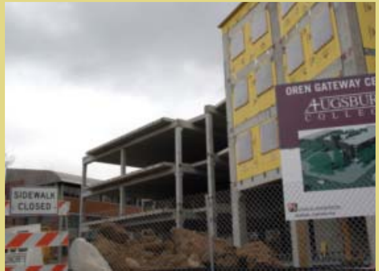
In the left back corner of the photo, the roof of Lindell Library provides context to the construction of the Oren Gateway Center, scheduled for completion in the fall.