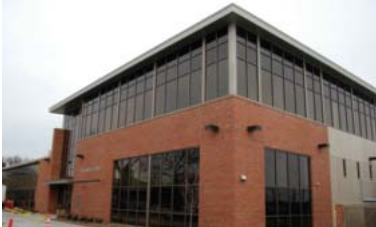
The Kennedy Center, the new three-story south wing added to Melby Hall, is open for classes, athletic teams, intramural teams, and fitness.

The three-story addition to Melby Hall features a new wrestling training facility, increased classroom space, expanded locker-room facilities and expanded fitness facilities, as well as hospitality, meeting-room, and office space.