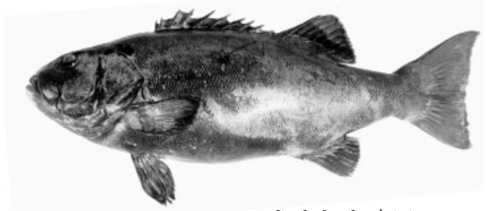
Giant Sea Bass, Stereolepis gigas

Despite the conspicuous size and protected status of giant sea bass, there are no published scientific studies to provide details of the biology and habits of this creature. In the eastern Pacific, giant sea bass range from Humboldt Bay to the tip of Baja California, and occur in the northern half of the Gulf of California. Some authors have stated that this species is also found along the coast of northern Japan and the Sea of Japan, but this may be a case of mistaken identity. Within California it is rarely found north of Point Conception. Adult giant sea bass seem to prefer the edges of nearshore rocky reefs. These reefs are relatively shallow (35 to 130 feet) and often support thriving kelp beds. Although the kelp may disappear due to a strong El Niño or overgrazing by sea urchins, giant sea bass remain at the reef. At certain times of the year,