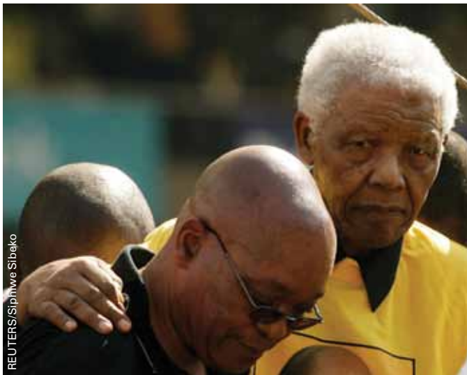
Nelson Mandela with ANC leader Jacob Zuma, who is now South Africa’s President