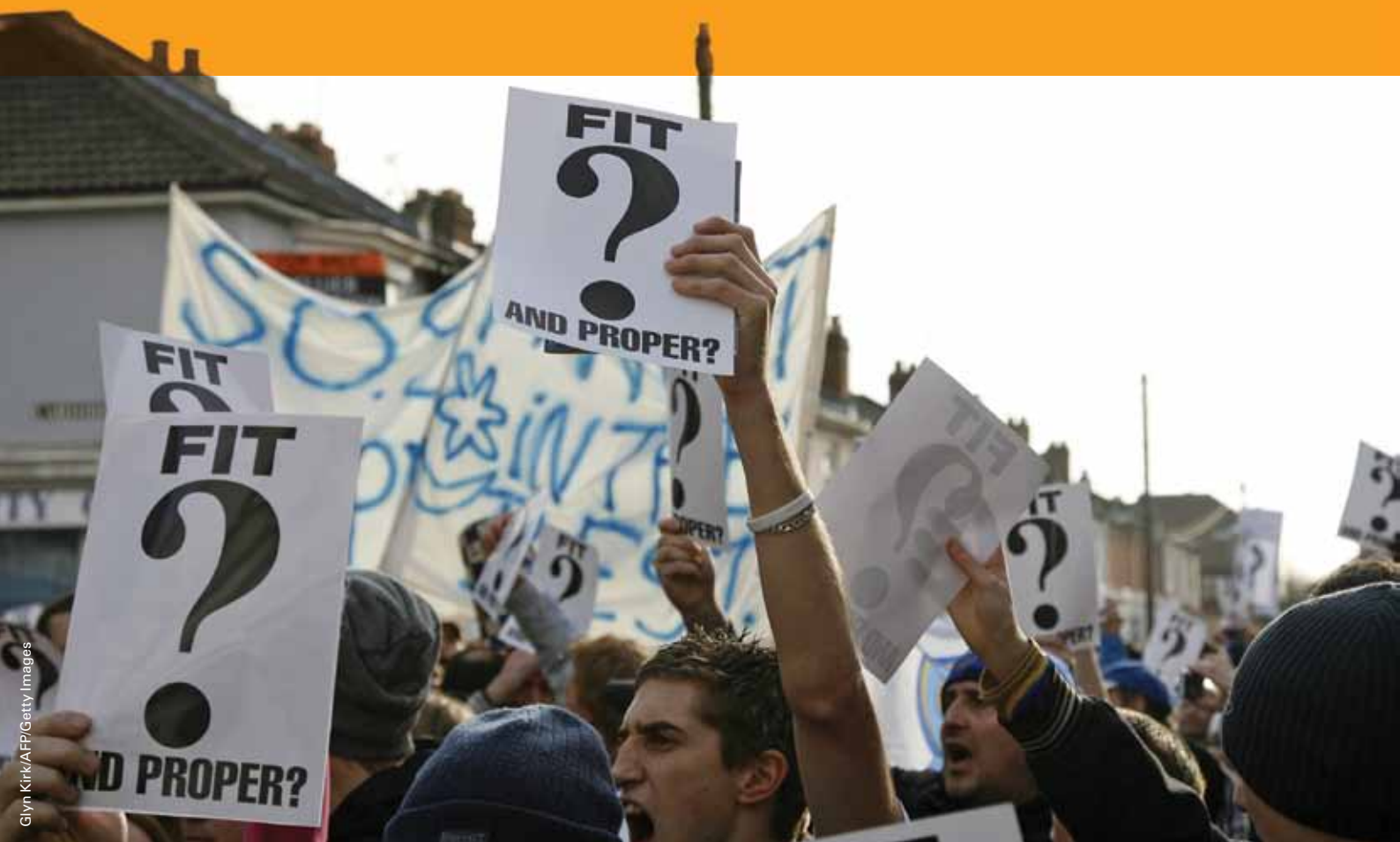
Angry Portsmouth fans demanding to know whether the club is in the hands of 'Fit and Proper' owners