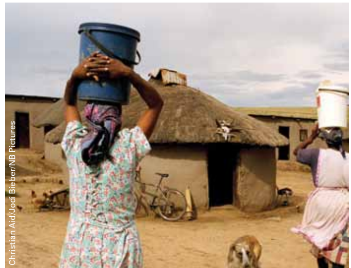
Collecting water in rural South Africa

In general, they are no less affected by secrecy jurisdictions than high-income OECD countries – and some of them are much more exposed. So the G20 and others are right to