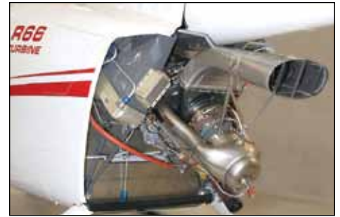
The Rolls Royce RR300 turboshaft engine was specifically designed for the R66.