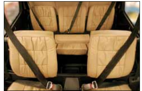
Five seats in an open cabin configuration provide passengers comfort and an unobstructed view.