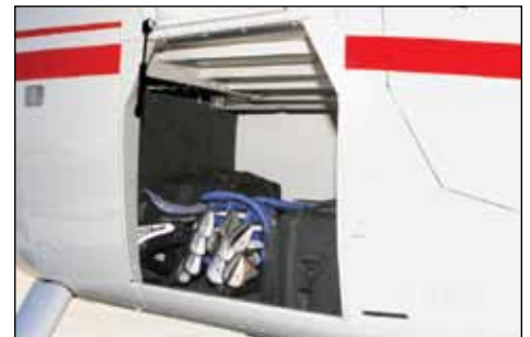
A large baggage compartment accommodates full-sized luggage.

Gross Weight . . . . . 2,700 lbs Empty Weight (incl oil & std avionics) . . . 1,280 lbs Max Fuel (73.6 gal). . . . . 493 lbs Passengers & Baggage (with max fuel) . . . 927 lbs