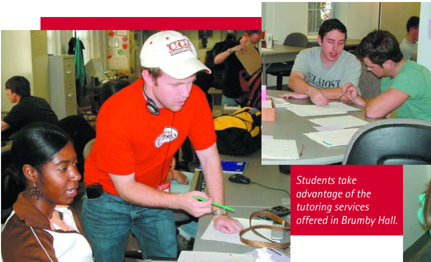
Students take advantage of the tutoring services offered in Brumby Hall.