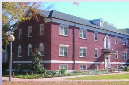
Mary Lyndon Hall