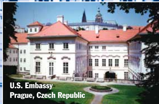
U.S. Embassy Prague, Czech Republic