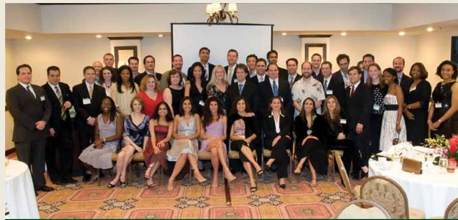
Members of the Class of 1998 gather at a reunion during Medical Alumni Weekend last March.