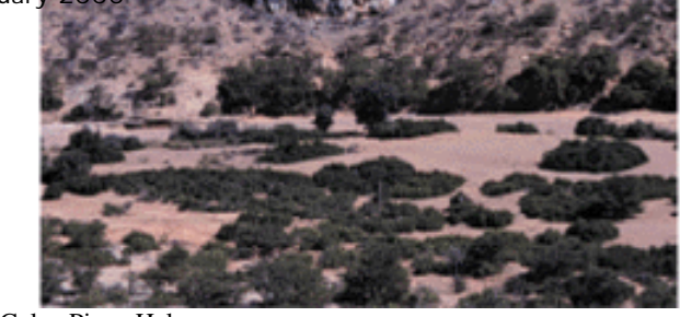
ROCKY CLIFFS along Namibia's Skeleton Coast have provided some of the best evidence for the snowball earth hypothesis.

which describes how the planet's thin, rocky skin is broken into giant pieces that move atop a churning mass of