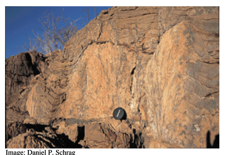
PURE CARBONATE LAYERS stacked above the glacial deposits precipitated in the warm, shallow seas of the hothouse aftermath. These "cap" carbonates are the only Neoproterozoic rocks that exhibit large crystal fans, which accompany rapid carbonate accumulation.

The first of these objections began to fade in the late 1970s with the discovery of remarkable communities of organisms living in places once thought too harsh to harbor life. Seafloor hot springs support microbes that thrive on chemicals rather than sunlight. The kind of volcanic activity that feeds the hot springs would have continued unabated in a snowball earth. Survival prospects seem even rosier for psychrophilic, or cold-loving, organisms of the kind living today in the intensely cold and dry mountain valleys of East Antarctica. Cyanobacteria and certain kinds of algae occupy habitats such as snow, porous rock and the surfaces of dust particles encased in floating ice.