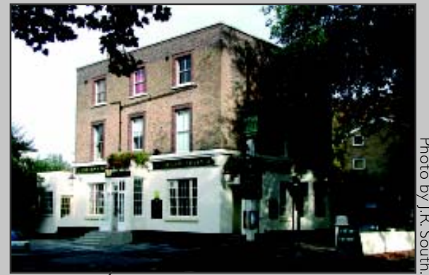
The Grove Tavern, Grove Road.