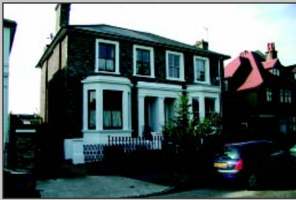
St. Leonards Road.