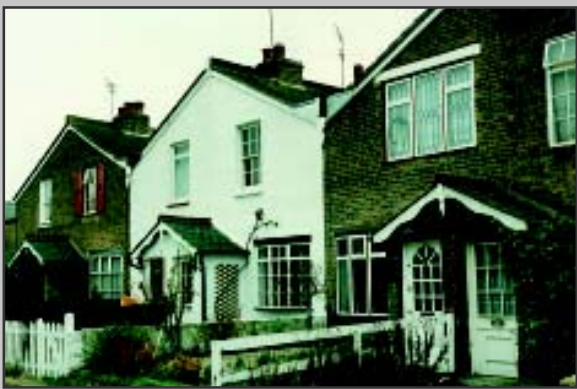
St. Leonards Square.