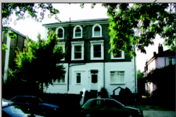
St. Leonards Road.