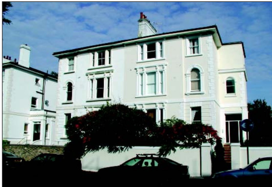
Uxbridge Road.