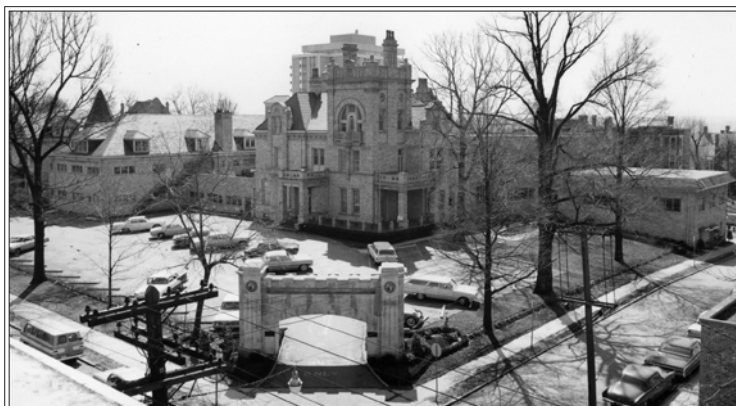
DAV NATIONAL HEADQUARTERS, CINCINNATI, OHIO, 1960's

The decision to build a new National Headquarters in Cold Spring, Kentucky, had been made in 1964. The 31-acre site selected was just a few miles south of downtown Cincinnati. Ground was broken for the new 115,000-square-foot headquarters in ceremonies that climaxed the spring 1965 meeting of the DAV National Finance Committee.