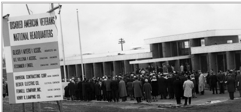
DAV NATIONAL HEADQUARTERS DEDICATION, COLD SPRING, KENTUCKY, 1966

Several factors prompted the move, including the business taxes the DAV had to pay the State of Ohio for its Cincinnati headquarters. Kentucky had no such tax at the time.