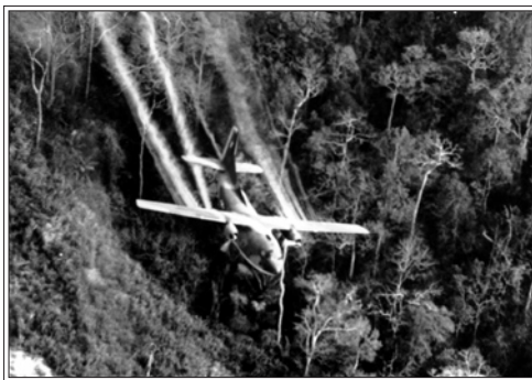
A C-123 PROVIDER AIRCRAFT SPRAYS AGENT ORANGE IN VIETNAM

The dedication shown by our Nation's Vietnam veterans serving as DAV NSOs was extensive. At one time, Vietnam veterans comprised more than 80 percent of DAV's National Service Officers. Their determined hard work in support of disabled veterans and their families was significant as they faced a long period in which such issues as Agent Orange and chemical and biological testing issues were slow to evolve. The federal government was slow to answer questions about exposure, anticipated illnesses, and critical consequences. Years would pass before illnesses were diagnosed as service connected. It was the DAV's corps of NSOs that dutifully and relentlessly persisted on behalf of our Nation's veterans to ensure that the service and sacrifice of our Nation's Vietnam veterans would be honored as much as those of veterans of all wars.