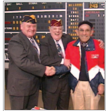
NEW YORK DELEGATION MEETS WITH YOGI BERRA