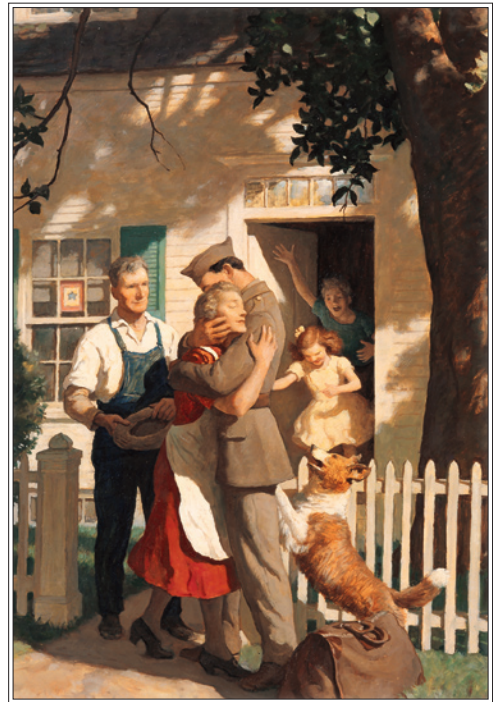
THE RETURNING SOLDIER —1944 BY N. C. WYETH