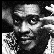
Filmmaker Ousmane W. Mbaye