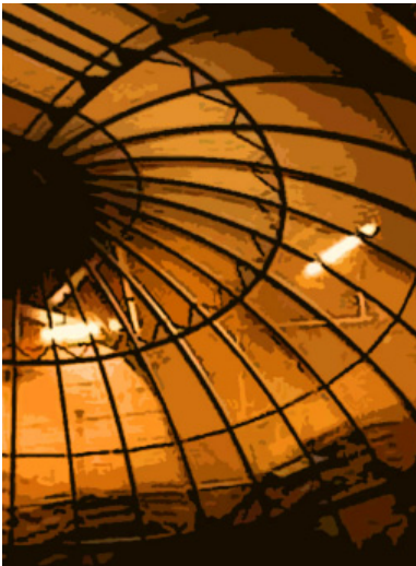
UCSB Allosphere: CNSI http://www.mac.ucsb.edu/allosphere/

Thurs., March 13, 2008, 4:30 p.m. Karl Geiringer Hall, Free Admission