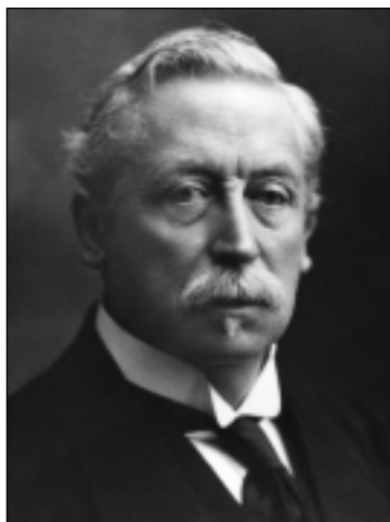
Dutch physician Christiaan Eijkman demonstrated the relationship between nutritional deficiency and disease through his studies of beriberi in Indonesia during the late nineteenth century—work that earned him the 1929 Nobel Prize for Physiology or Medicine.