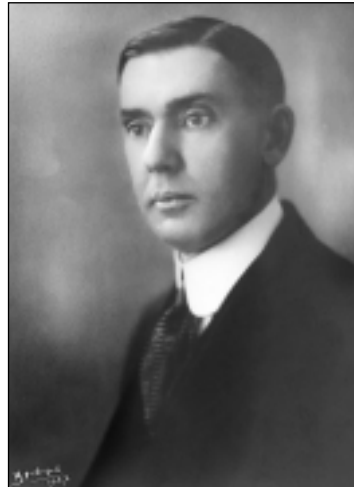
First at the University of Wisconsin, and later at Johns Hopkins University, Elmer V. McCollum carried out seminal research establishing the existence of the vitamin B complex, vitamin A, and vitamin D.

By the early 1920s, then, it appeared that the world had two cures for rickets: cod-liver oil and irradiation—that is, exposure to sunlight or ultraviolet light. Despite this promise, the disease remained