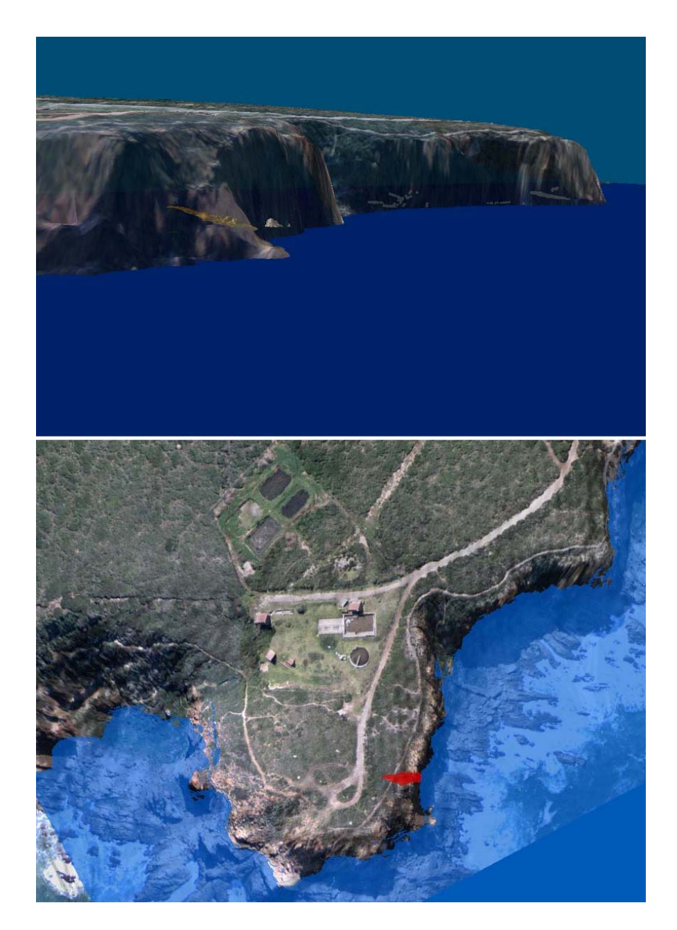
Figure 2 The top image shows what the mean sea level during MIS 5e would have looked like in relation to current topography and the positions of Cave 13B and Cave 13F (submerged). The bottom image is a top-down view of the same model showing the semi-transparent MIS 5e sea level overlaid on top of a georeferenced image of the current sea level. Cave 13B is represented in red.