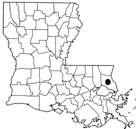
Fig. 2. Parish records.