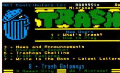
Trash is a Third Millennium Systems Game.

A witty, surreal affair where you are endowed with amazing Psionic powers to help you as you travel around a futuristic multiverse gathering intergalactic garbage to incinerate and score points. Watch out for the fire breathing cabbages and raining blancmanges!