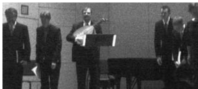
Blue Heron Renaissance Choir

One last curiosity: the travel expenses for the Italian speakers were covered not by an academic or a musical institution, but by a construction company based in Rome (CO.GE.L. S.p.A.), and chaired by an Italian woman who is deeply fond of classical music. You really never know where you can find a sympathetic ear for your cause.