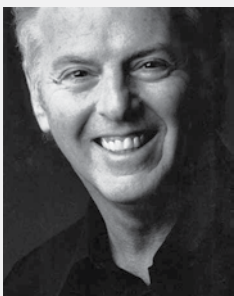
The Norton Lectures: Daniel Barenboim