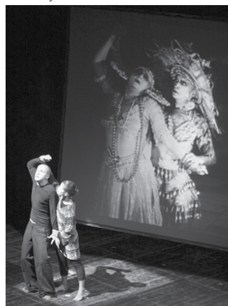
Rehearsal of Mother Goose at the Forli Festival.