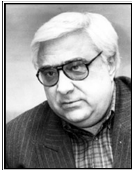
Former Prime Minister Andrey Lukanov