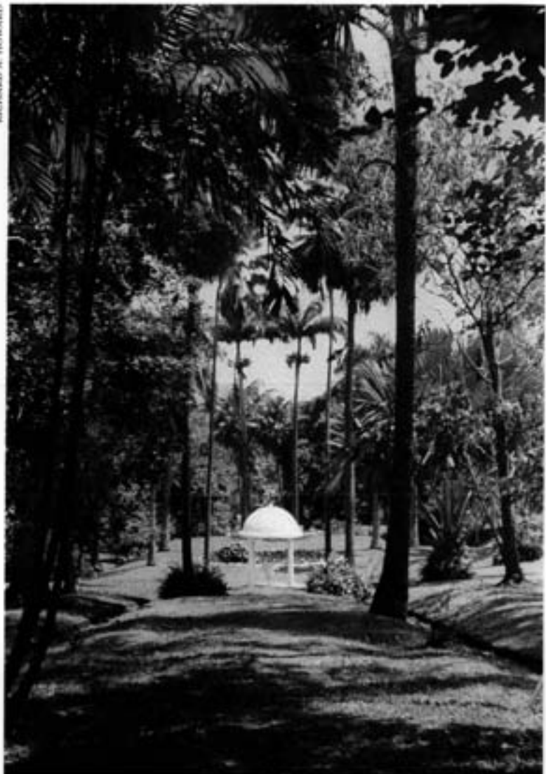
This temple houses a fountain in the form of an allamanda flower. The garden still maintains many historical medicinal plants such as the source of chaulmoogra oil, which is used in treating leprosy, and the lignum vitae, long thought useful in treating symptoms of syphilis. The collection of palms is especially notable, and a new inventory is much desired. The garden's largest breadfruit trees represent three of the varieties introduced by Bligh on the Providence. All are vegetative propagations of an earlier plant. The original superintendent's house is now a museum that specializes in artifacts of the Caribs and other indigenous groups.

plants introduced into cultivation in the British Caribbean.