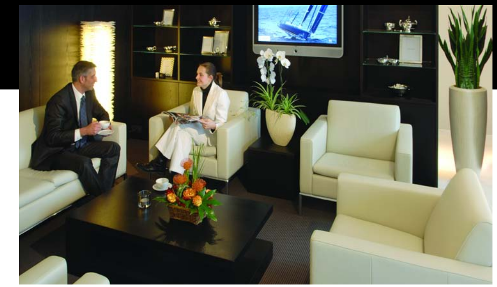
Three of ExecuJet's facilities made the top 40 list of international FBOs. The company's Berlin facility, which was not included last year, ranked number 25 this year.

Biggin Hill is also finalizing plans to expand its ramp space and to start building a 50,000-sq-ft hangar next to the main terminal. This will be able to accommodate