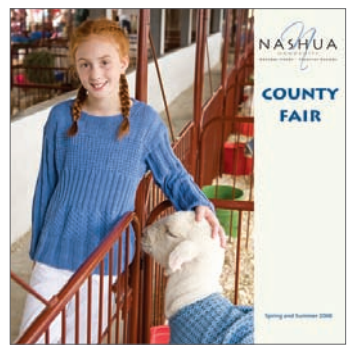
County Fair (NHK29)