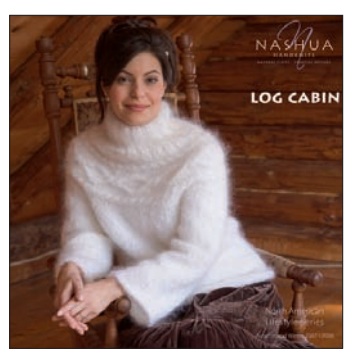
Log Cabin (NHK21)