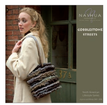
Cobblestone Streets (NHK24)