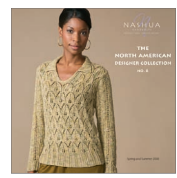
North American Designer Collection No. 6 (NHK31)