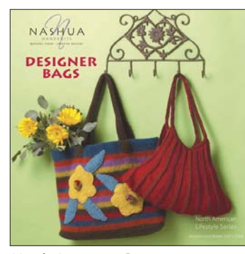
North American Designer Bags (NHK26)