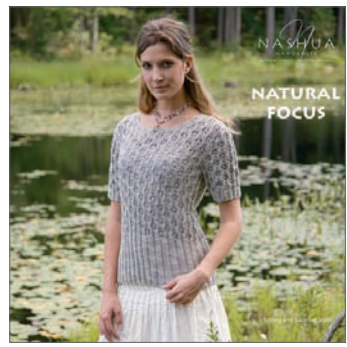
Natural Focus (NHK28)