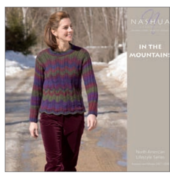
In The Mountains (NHK19)