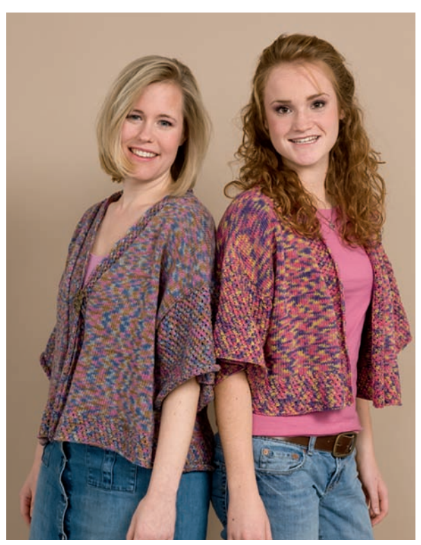
Kimonos Left: Desert Flower in Mauve Slate (NDF.3574) Right: Desert Flower in Berry Citron (NDF.3577)

Work Diagonal Openwork Stitch until neckband meas 2" [5 cm]. Last row: P and bind off all sts. Weave in ends. Block lightly.