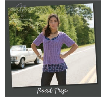
Road Trip (NHK30)