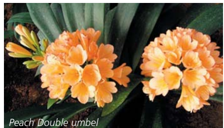
Peach Double umbel