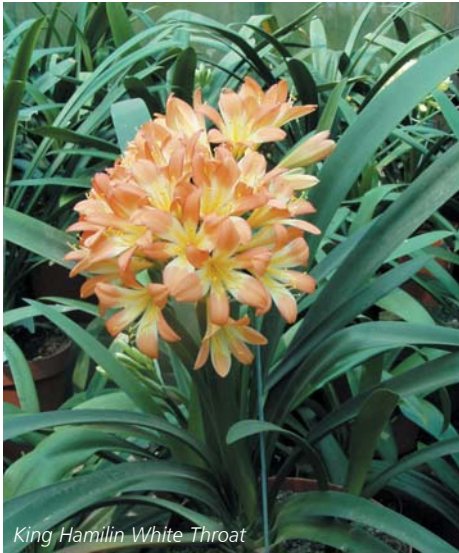
King Hamilin White Throat