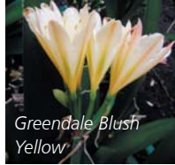
Greendale Blush Yellow