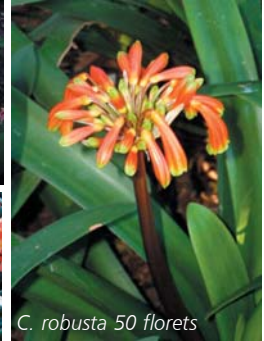
C. robusta 50 florets