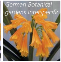
German Botanical gardens Interspecific