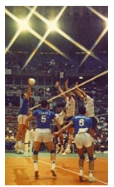
FIVB World League Italy 1990

Volleyball's flagship annual event, started by the FIVB in 1990, is a spectacular showcase for the crème de la crème of Men's Volleyball. The 2008 edition featured 16 National Teams playing 106 matches over seven consecutive weekends in 42 cities across the globe and competing for more than USD 20 million in Prize Money. The 2008 Final Round was contested by six teams in Rio de Janeiro through July 23-27. The total attendance for the 2007 edition was 637,000 fans, with 2,244 hours of television coverage and more than 1 billion TV viewers for the Final Round, with 757 hours of live TV coverage.