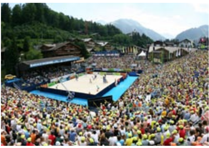
SWATCH FIVB World Championships Gstaad 2007

Staged every two years, the SWATCH FIVB Beach Volleyball World Championships feature the brightest stars of the SWATCH FIVB World Tour, with 48 teams of each gender taking part. The 2009 World Championships are set to take place in Stavanger, Norway, with total Prize Money of USD 1 Million. The chosen city will hope to emulate and improve upon the huge success of the 2007 event in Gstaad, Switzerland. Held in the foothills of the Swiss Alps, the event attracted tens of thousands of fans and showed how Beach Volleyball can be played everywhere and not only beside the sea.