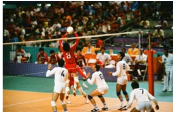
Los Angeles 1984