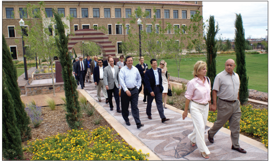
Delegations from the Greater San Antonio and the Greater El Paso chambers of commerce tour the Paul L. Foster School of Medicine.