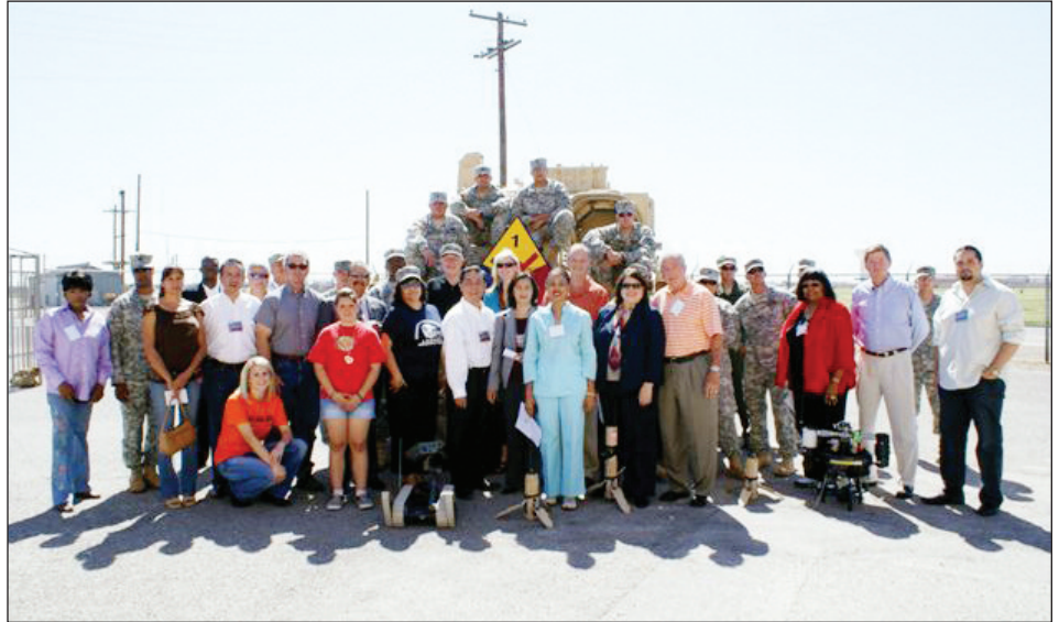
Texas state legislators and Team El Paso pose for a group picture during a visit to Fort Bliss.

Even though Fort Bliss was hosting its Senior Leaders' Off-site Retreat that weekend, Fort Bliss opened its doors to the legislators and provided them with a comprehensive briefing on the transformation underway and the plans to grow to accommodate the soldiers and families coming to El Paso through the Base Realignment and Closure process. After the briefing, the legislators interacted with the soldiers overseeing Future Combat Systems and were able to learn more about the technology that is paving the way for our armed forces. The interaction with the future combat systems illustrated to the legislators the advances in war fighting. A windshield tour provided the legislators to see the growth firsthand. Following the windshield tour, the legislators joined soldiers in the mess hall for lunch