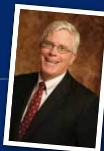
Hugh Hewitt Author, Law Professor, Radio Host