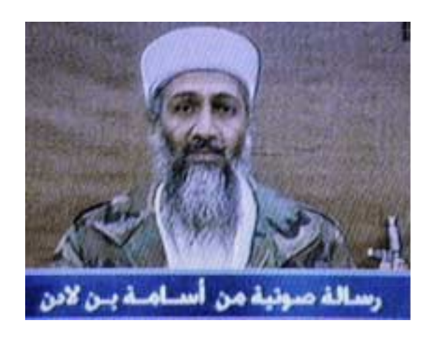
Text at bottom reads "Voice message from Osama bin Laden." Al Jazeera satellite channel broadcast 10/6/02.

transition" in the GCC states: mortality rates have fallen sharply, but fertility rates have fallen only very moderately and remain very high by international standards. Past high rates of population growth fifteen to twenty years ago translate into very rapidly growing labor supplies today. The private sector cannot currently take up the slack in employment creation. The sector is a) too dependent on state largesse and b) relatively too small to do so. Most importantly, however, the countries of the Gulf have limited comparative advantages in non-oil goods or services. Wage rates, seriously inflated by past oil rents and current consumer subsidies, are far too high to compete in low wage activities, but skills are too low to compete in more sophisticated activities.