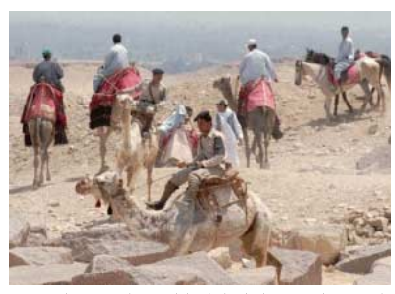
Egyptian policemen patrol on camels beside the Chephren pyramid in Giza in the outskirts of Cairo Friday, April 19, 1996. Security around tourist sites has increased discretely after a suspected Islamic radical group killed 18 Greek tourists in an hotel nearby Thursday.

kind were often denigrated as symptoms of cowardice or treason. Pundits and policy makers suggested that to argue that phenomena such as al-Qaeda had social roots was to excuse, or even condone, their apocalyptic actions. As the political scientist Thomas Homer-Dixon pointed out, such arguments are "grade-school non sequiturs". After all, historians who study Nazism do not justify Auschwitz, and students of Stalinism do not exonerate the perpetrators of the Gulag. Understanding is simply better than the alternative, which is incomprehension. If we fail to grasp the forces behind the attacks of September 11, we will fail to respond wisely.