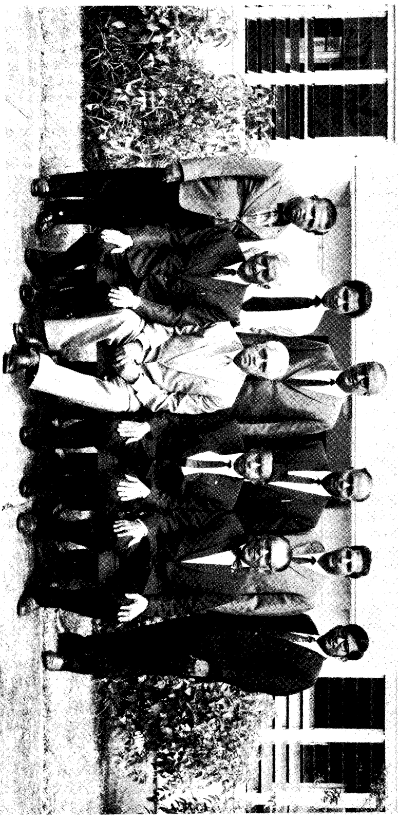
BOARD OF DIRECTORS OF AHMADIYYA ANJUMAN ISHAAT-I-ISLAM OF FIJI - 1972-73