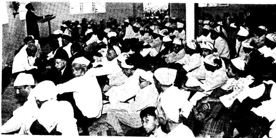
A section of the congregation at Eid Prayer at the Anjuman's Hall, 12 Bau Street, Suva.

The success and the future of the Anjuman lied in the hands of each and every member. The members of the Board of Directors and/or the President and the Secretary are merely administrative weapons. But the ultimate result rests in the hands of the members. Accordingly, we urge and request the members to do their share and give full hearted support to the Anjuman. It is the religious duty of every Muslim to do propagation work and to spend for the cause of Islam.