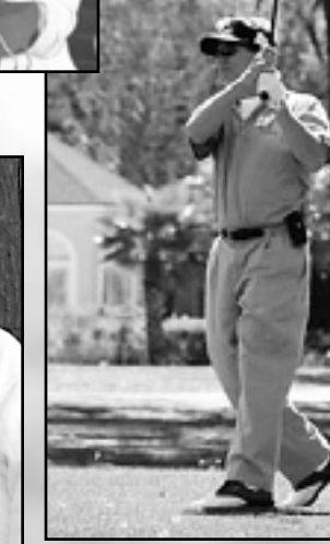
A golfer watches his shot