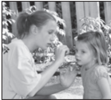
Face painting is very popular at Fall Fest.

The Nashville Chapter presented the 21st Annual Fall Fest Sept. 16-17 at Belle Meade Plantation. The two-day family event featured fine antiques, noted crafters, musical performances, jewelers, children's games and entertainment and food for all tastes.