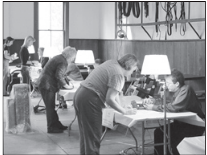
Appraisers busy at the appraisal fair