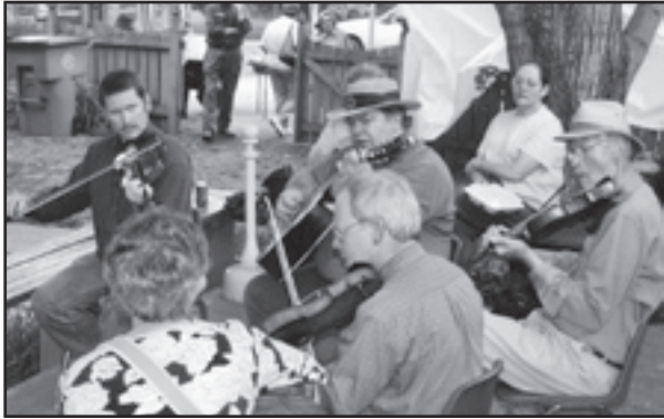
The Nashville Old Time String Band plays for the Fall Folk Festival at the Buchanan Log House

On Sept. 16 the Buchanan House Fall Folk Festival featured many “old time games” and demonstrations of quilting, weaving, caning and several crafting activities in which children and adults participated. Frontier reenactors, storytellers, music and dancing was the entertainment throughout the day.