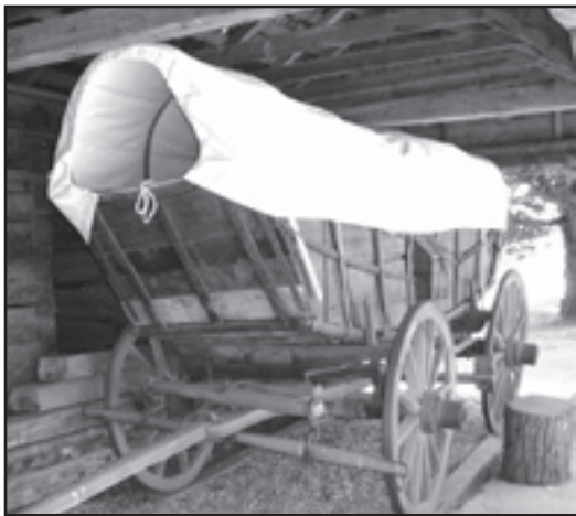
The Conestoga wagon with its new cover at the Crockett Tavern Museum.