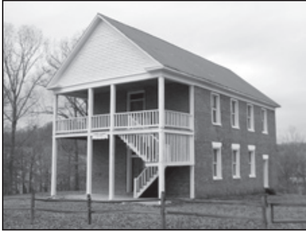
This school building built in 1901 was used as the home for Maxwell Academy and then later as a public school before it was closed in 1942.

The Hawkins County Chapter will host a booth during Rogersville Heritage Days Oct. 13-15 to showcase APTA and the historic sites within Hawkins County, such as 100 year farms, First Families and Maxwell Academy. Postcards of area spots such as the now-gone “The Tennessean” restaurant and Pressmen’s Home area will be sold from the booth and a walking tour of historic downtown will be conducted.