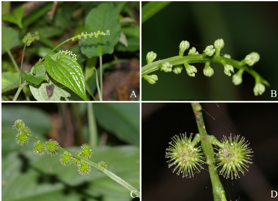
Figure 2. Zippelia begoniifolia Blume: A. branch with inflorescence and infructescences; B. inflorescence; C. infructescence; D. fruits. (Photographed by C. Suwanphakdee).