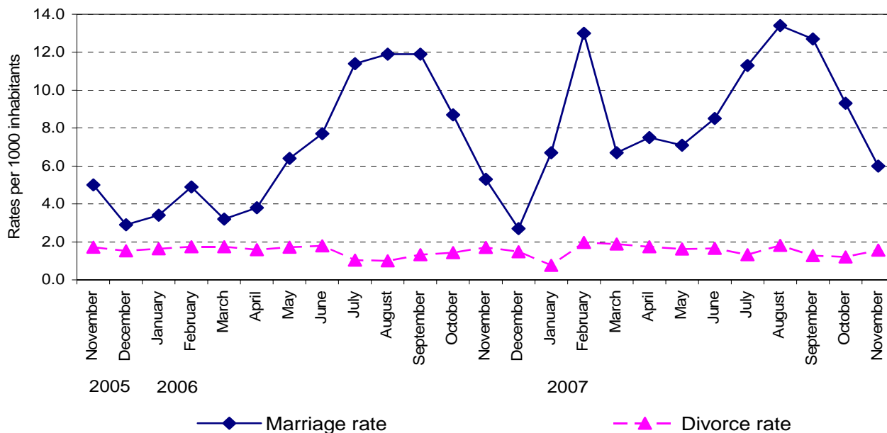
Evolution of marriage rate and divorce rate during the period December 2005 – December 2007

3146 divorces were granted by final court decision, up by 0.4 thousand cases, with the divorce rate being 1.72 divorces per 1000 inhabitants in December, compared to 1.57‰ in the previous month.