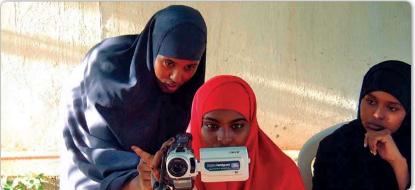
Access to information, empowerment and 'voice' are at the heart of the BBC World Service Trust

The BBC World Service Trust is the BBC's international development charity. It aims to reduce poverty and promote human rights in developing countries through the innovative and creative use of the media.