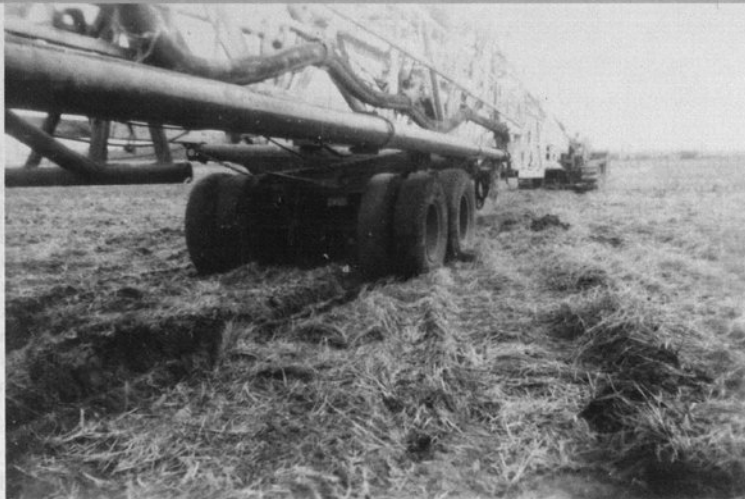
One of the headaches which will plague the farmer of the future is compaction of the soil by heavy machinery. Erich Fruehauf says the danger is played down by the manufacturers of big tractors and implements, but he has seen a good example of the problem on his farm. In that experience, heavy portable oil field equipment was pulled across his land by two Caterpillar tractors, and despite farming and deep plowing the track is still visible 25 years later.

the future. One of them is compaction of the soil by ever heavier tractors and implements. The danger is played down, naturally, by the manufacturers of such equipment and not taken very seriously by the happy users of big machines, a small evil easily outweighed by the other advantages. But I can judge by my own experience the effect of compaction. In 1950 two Caterpillar tractors pulled a heavy portable oil derrick across one of my fields to a drilling location. Despite continuous farming and deep plowing this track is still visible 25 years later. It shows up as a band where the wheat stands four inches shorter than in the rest of the field.