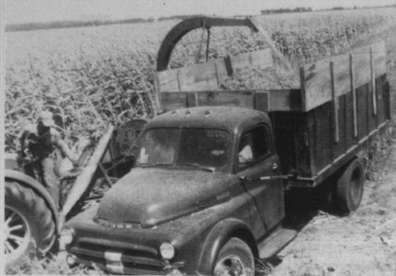
In the late 1950's the use of silage for winter feeding of cattle became popular. Silo filling in the fall brought together the commercial operator of a high-powered field cutter, and the neighborly exchange of labor for hauling and packing the crop in the trench silo. A day's labor usually solved the problem of preparing feed for the winter for the average herd. In this photograph silage is being harvested with a field cutter.

surface while underneath there was nothing but soupy mud.