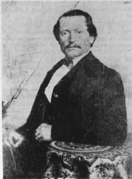
John alias Jack McCall who shot Hickok through the back of the head as he sat in a poker game in Deadwood, D.T., August 2, 1876. In the trial that followed, McCall was found guilty and on March 1, 1877, he was hanged.