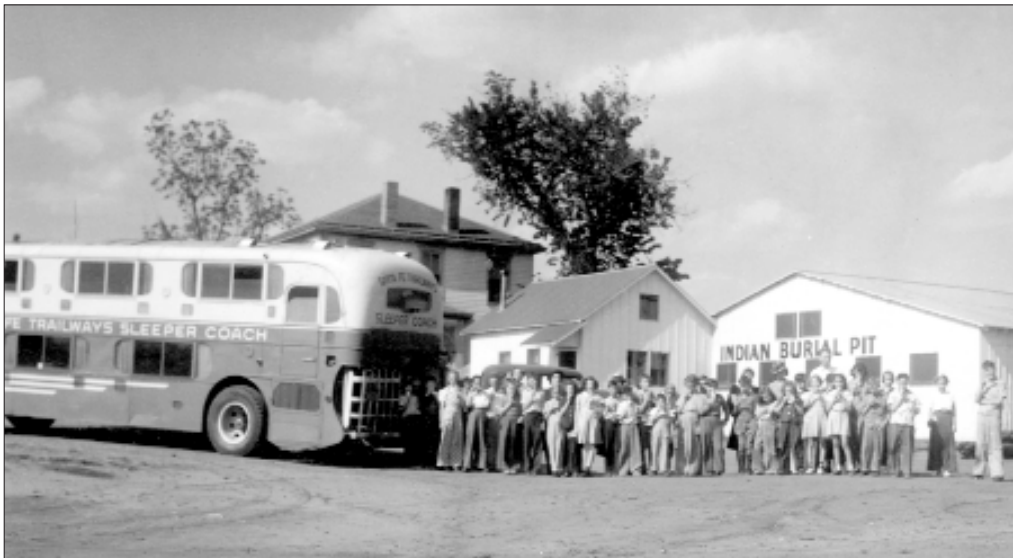
The Indian Burial Pit became a popular tourist attraction, and, in addition to being amateur archeologists, the Whitefords became promoters, writers, tour guides, and lecturers. The building housing the pit also contained a gift shop where tourists could purchase Indian-related curios.

testimonials from archeologists and others as to the importance of the site. 20