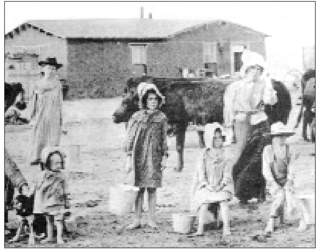
Well into the mid-twentieth century rural women were tending huge gardens, performing all cooking and baking tasks, canning, butchering, rendering lard, making apple butter, and seeing to the production of milk, butter, cottage cheese, and eggs. (Above) Women and children tend to typical chores on this Thomas County farm, ca. 1895.