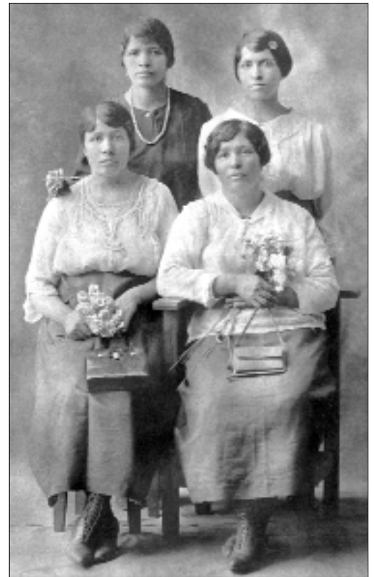
The experiences of Kansas women of color — Hispanic, Native American, and African American — have yet to be fully developed in the scholarship of western women’s history. (Above) An unidentified group of Hispanic women poses for a portrait in Topeka.

In summary, the past thirty-five years have been an exciting and stimulating period for researchers writing about women and gender in Kansas history. The quantity and quality of scholarship have expanded and improved in both content and analysis. However, it is time to expand upon and move forward from our “idyllic” nineteenth-century past into a broader analysis and understanding of women and gender in all aspects and time periods of Kansas history. Utilizing the recent scholarship in women’s history and western history, historians have access to large contextual frameworks to further understand and analyze women and gender in Kansas history. The scholarship during the past three decades has provided important inroads and models for contemporary historians to build on, and the potential for further research promises rich and rewarding possibilities.