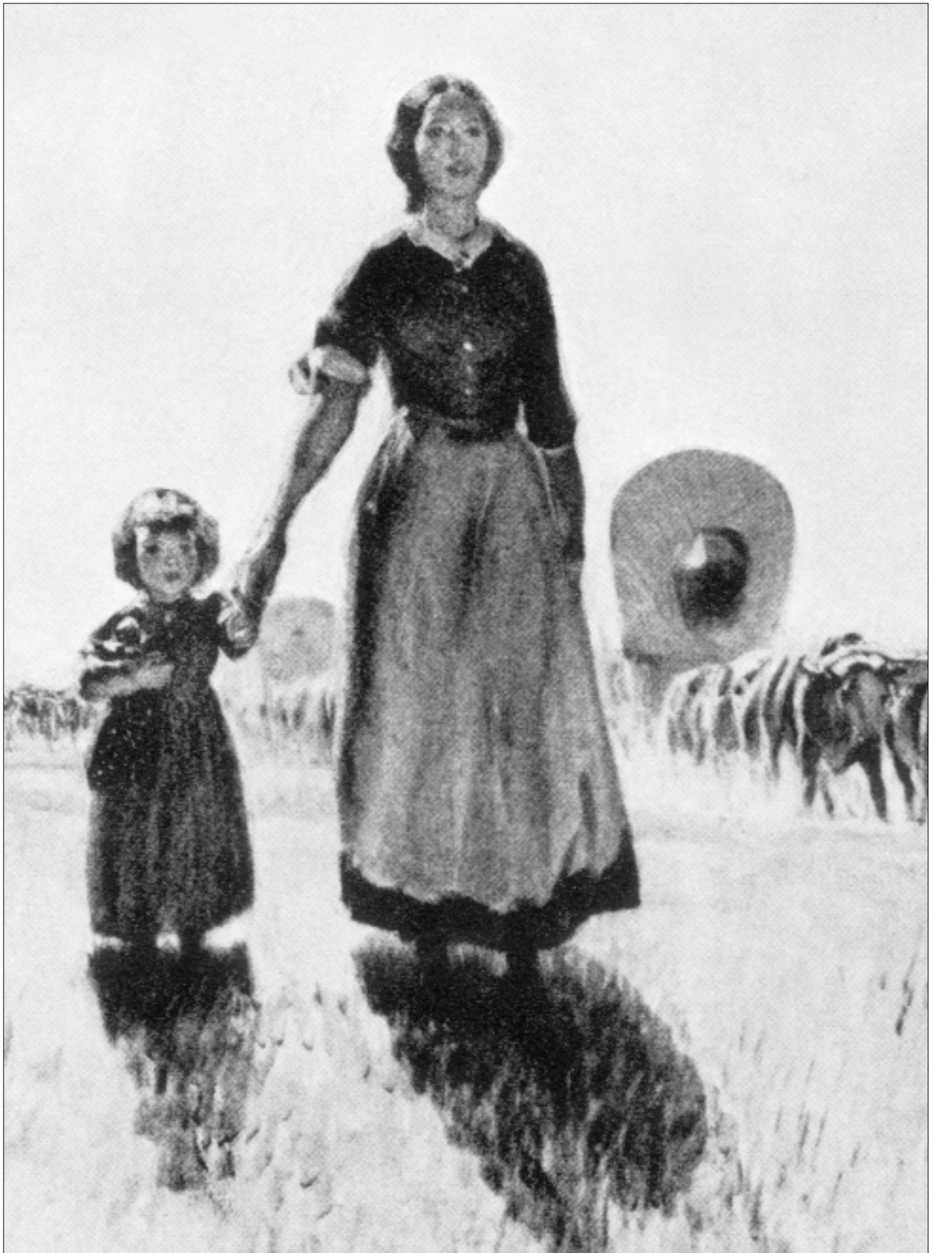
An artist's typical early-twentieth-century rendition of a woman of the West.