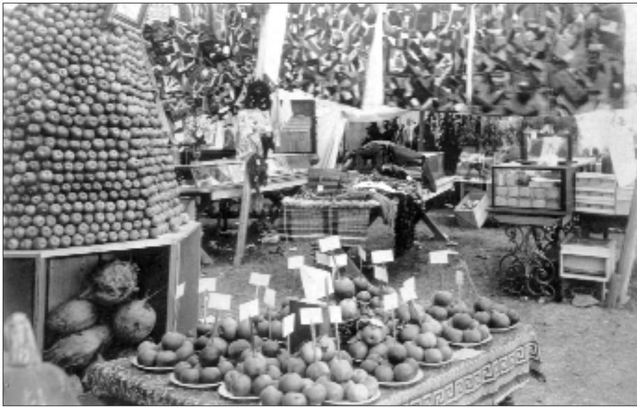
Crazy quilts were popular county fair entries. In this photo four crazy quilts are seen on exhibit at the 1894 Finney County Fair.

[f]ew Nebraska quiltmakers, especially those living during the late nineteenth and early twentieth centuries had time to waste on frivolous activities but could justify the pleasure they derived from creating beautiful quilts by the fact that they were producing functional items for their families' use. 22