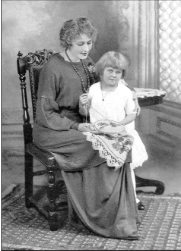
Doing needlework was a matter of course for women in the nineteenth century. Girls would learn how to sew at a very early age, as is evident in this 1899 illustration from Lessons in Embroidery.