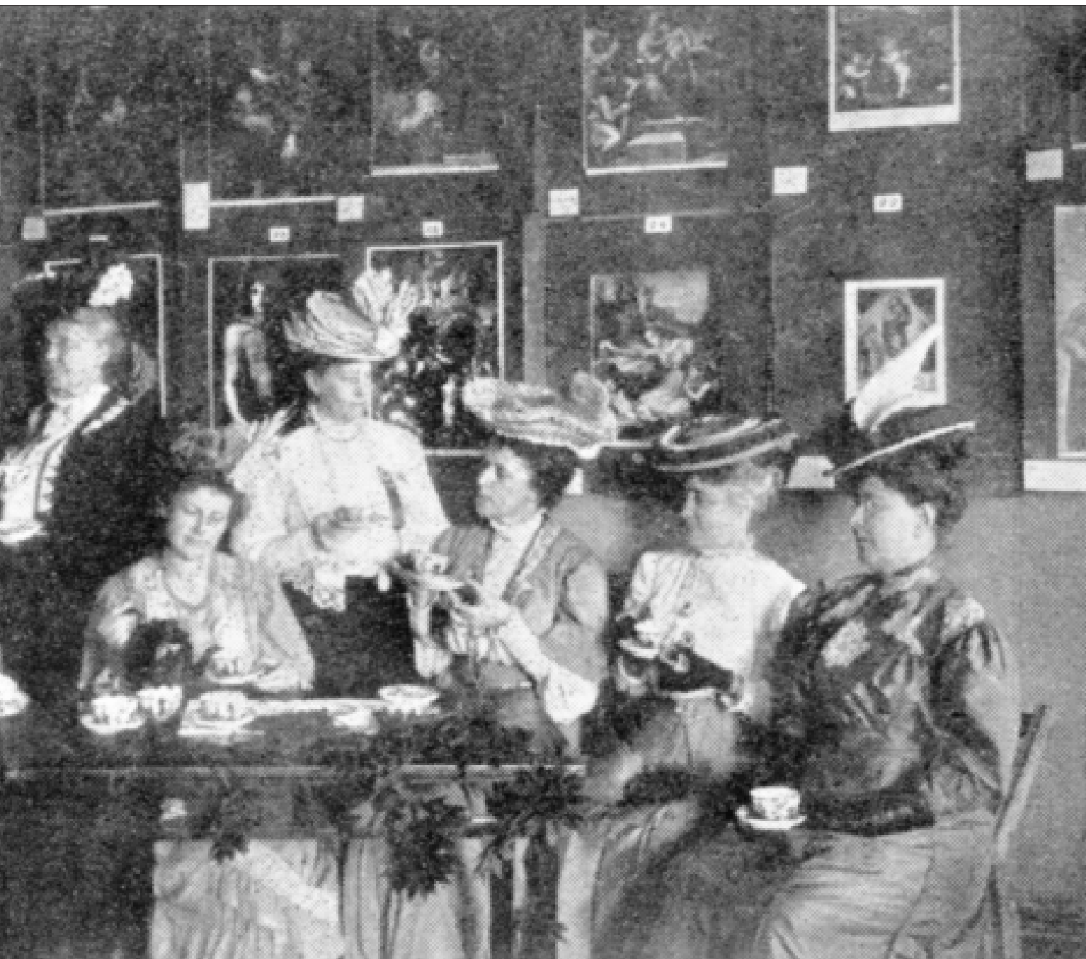
A collection of fine art forms the backdrop for members of the Kansas Federation of Women's Clubs gathered at the headquarters of the Kansas Traveling Art Gallery, 1906.