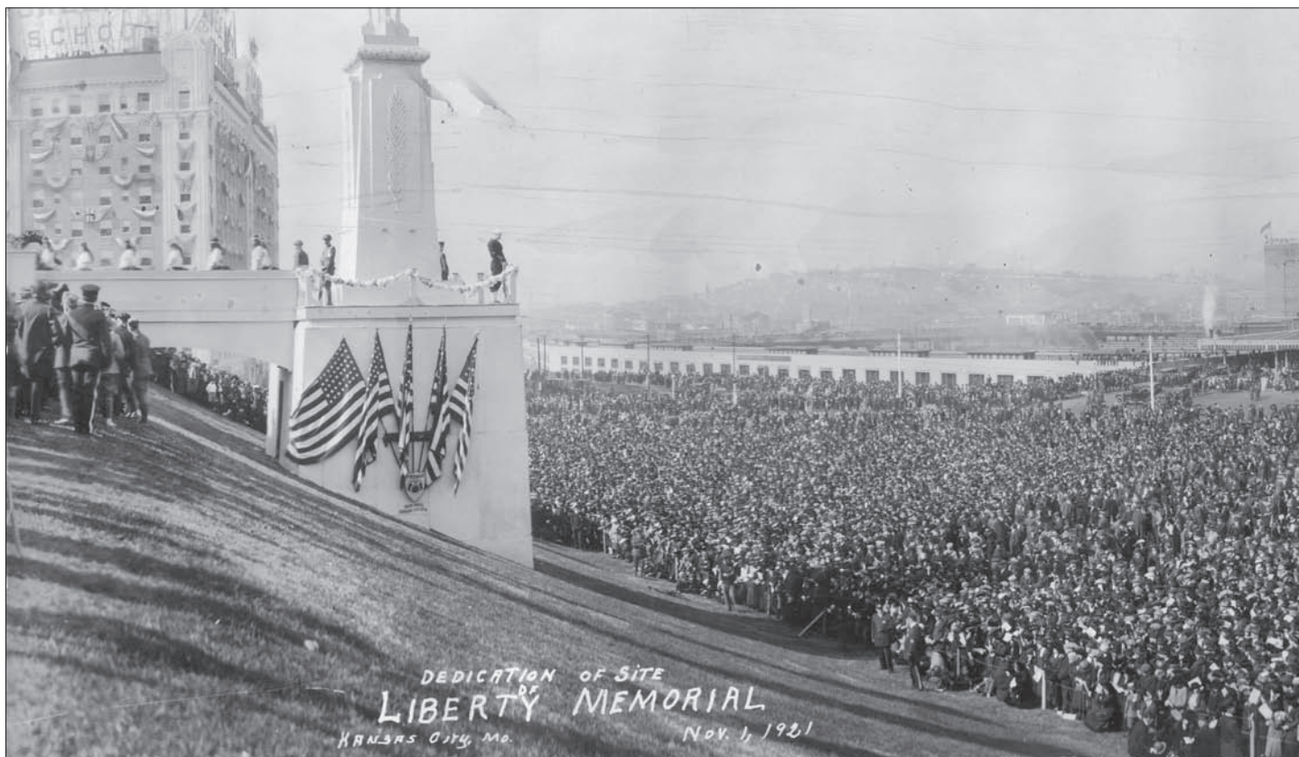
An estimated crowd of almost 200,000 attended the November 1, 1921, ceremony to dedicate the hill south of Kansas City's Union Station.

front, all have roots or precedents to the first quarter of the twentieth century. Add to that a growing consensus among modern historians who see the two world wars not as separate episodes but merely as an elongated continuation with an all-too-brief intermission. Suddenly the world of the American doughboys has become almost distressingly relevant to understanding our world today.