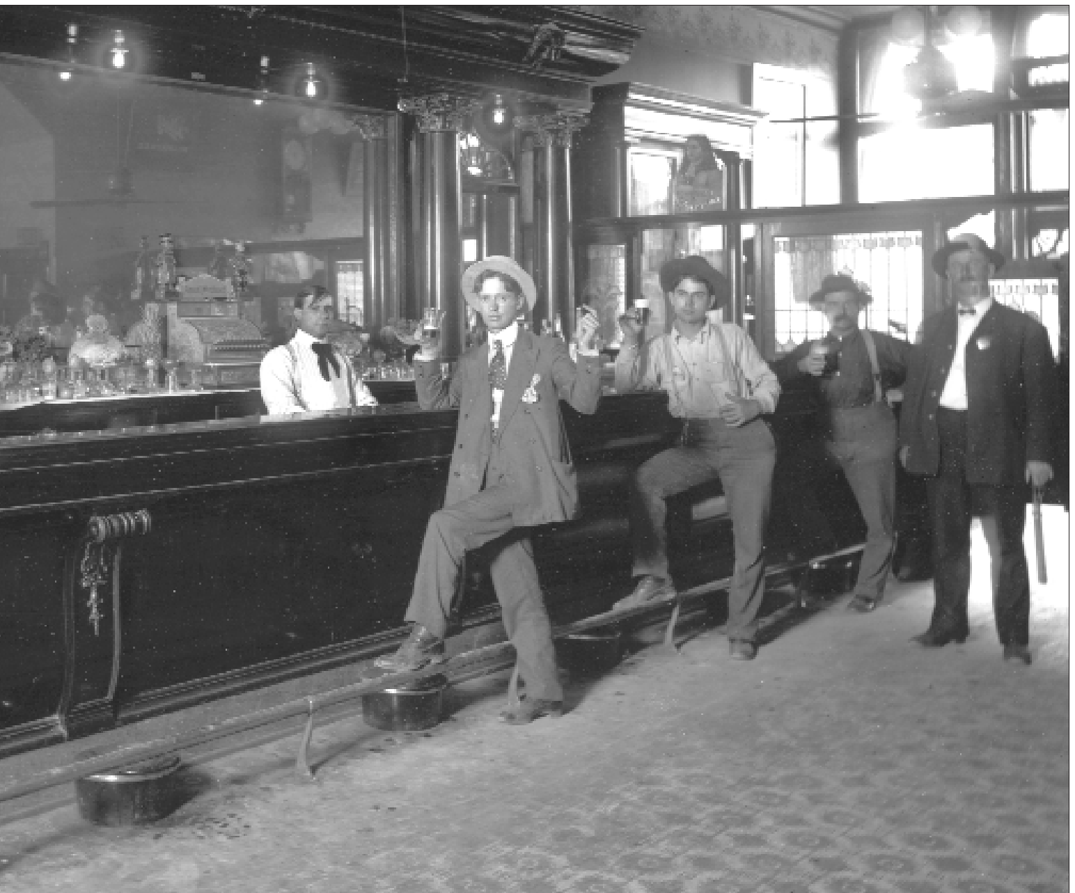
Customers, including a police officer (far right) at the Horseshoe Saloon in Junction City, 1906, pay little heed to liquor laws of the day.

hibition, and its history is reflective of the complex state personality. 1