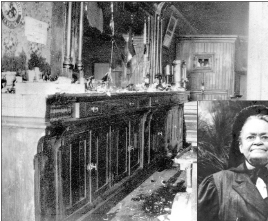
Onto the scene of brazen and open saloonism came the “Kansas Cyclone” Carry A. Nation (below) who raided bars and smashed joints in an attempt to cripple the flow of liquor. This Enterprise saloon (left) exhibits the work of Mrs. Nation and her hatchet.