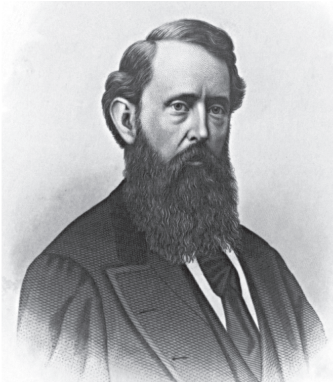
Along with his cousin Frank Blair, Benjamin Gratz Brown, usually called Gratz, was retained to represent the two accused Sacs following their arraignment. Brown, above, worked more closely on the case than Blair, perhaps because he was a younger lawyer still attempting to make a name for himself. He later embarked on a political career that would take him to the U.S. Senate and Missouri's gubernatorial mansion. In 1872 he secured the Liberal Republican Party's vice presidential nomination and ran on the ticket with Horace Greeley.

lowing his maiden speech in criminal court, two potential clients had rushed to hire him before he could leave the courtroom. 25 Brown took the lead in handling the Indians' case, but Blair was sufficiently involved to affix his signature to key defense motions and appeal documents.