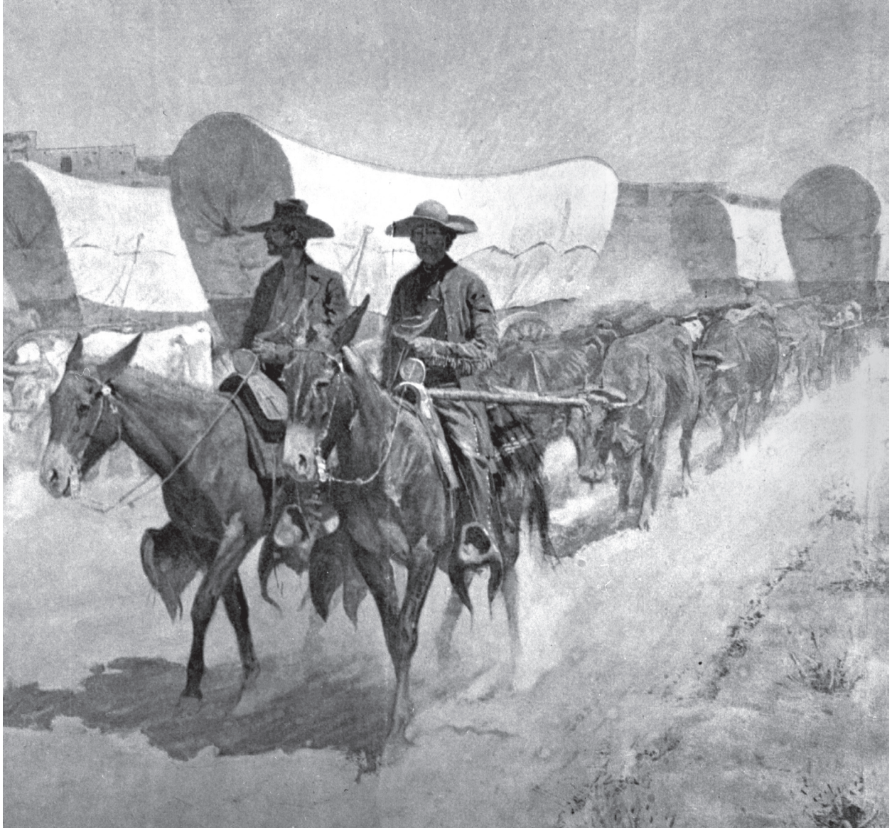
A portion of Frederick Remington's The Santa Fe Trade, 1904.