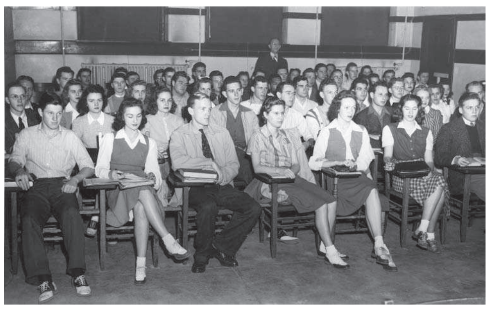
After WWII marriage preparation became the subtext for many women's education. By the mid-1950s one quarter of all urban, white, college women married while attending college in part because it was increasingly difficult for women to find professional positions and their chances to marry decreased the longer they waited. Above men and women attend class at KU in 1950.