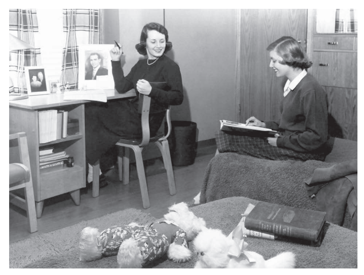
Kansas, a conservative state in the nation's center, seemed an unlikely locale for the activism of the women's movement, civil rights, and student protest. And indeed, female students at KU in the 1950s and 1960s did not initiate social change on campus. Pictured here two female students study in their KU dorm room.

these historians of unrest tend to see the 1950s and early 1960s as an age of consensus and traditional gender roles interrupted only in the late 1960s by a surge from enlightened, usually male, students. These same historians often posited that youth opposed university administrators who resisted reform and tried to quell