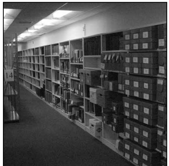
Boston City Archives facility at 201 Rivermoor Street, West Roxbury.

Planning the move required extensive and detailed calculations, measuring shelf space from a large variety of shelf types, measuring records volume of a large variety of physical formats, and fitting one with the other in the context of floor space and height restrictions in the new temporary facility. The city's Public Facilities Department made its consultant architect available for developing floor layout plans. This enabled Archives staff to develop a "Fourteen Step Plan" creating a basic structure for the sequencing of the move. Sections of the new records storage room were mapped out and dedicated for specific physical types: publications; records center car-