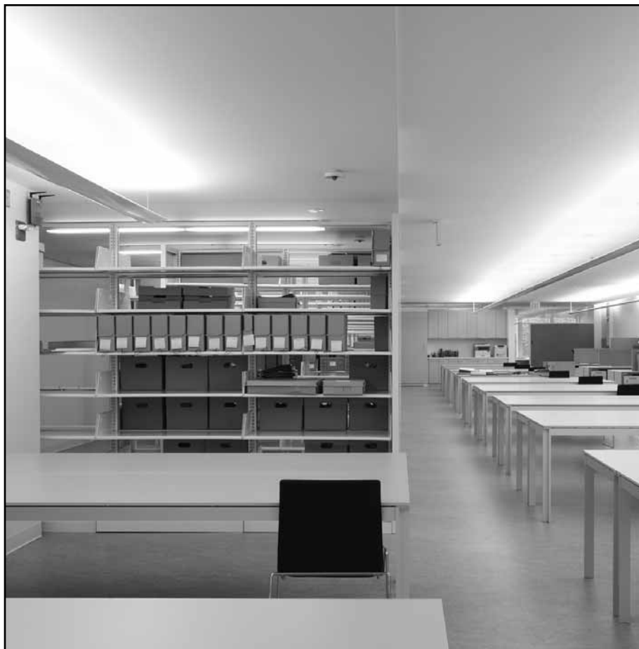
Beinecke Rare Book and Manuscript Library's new archival processing space.

we moved in. Our desire to implement more streamlined processing procedures and make good use of full-time, experienced processing assistants also required the archivists to read the unit's processing manual somewhat interpretively. Most daunting of all was that we decided not to install the unit's DOS-based finding aid creation software on computers in the new space; we asked the new staff instead to test out the beta version of the University Library's new finding aid authoring tool, with training from the unit's EAD archivist, but with minimal written instruction. This customized XMetal product allows for a fuller implementation of EAD and DACS recommendations than was possible with our previous system, but