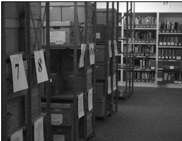
Boston City Archives facility at 201 Rivermoor Street, West Roxbury.

Of course, in the larger plan for Rivermoor, the move is not over. As of this writing, construction on Phase I of the Rivermoor project is expected to get under way by the autumn of 2007 and be completed by the end of 2008. The vastly greater proportion of space in this phase will be allocated for Boston Public Library use. Beyond accommodation for existing inventory, the Archives will be left with capacity for an estimated 3,000 cubic feet of new accessions. Future phases envision building extensions to the east and north. Only with such extensions will it be possible to expand archives capacity to a projected 30,000 cubic feet, and to incorporate an in-house records center operation with projected capacity needs of 80,000 cubic feet. The impending NHPRC project is expected to increase significantly transfers of archives and records from city departments to Rivermoor and ARMS respectively. At some point demand for records center services will increase to a level where an in-house operation will be more cost-effective than out-sourcing. And at some point archival outreach to departments will generate potential transfers greater in volume than the space allocated in Phase I. The critical question becomes whether archives and records capacity at Rivermoor will be available in a timely fashion to accommodate demands that the Archives Division has the duty to encourage and induce. ♡