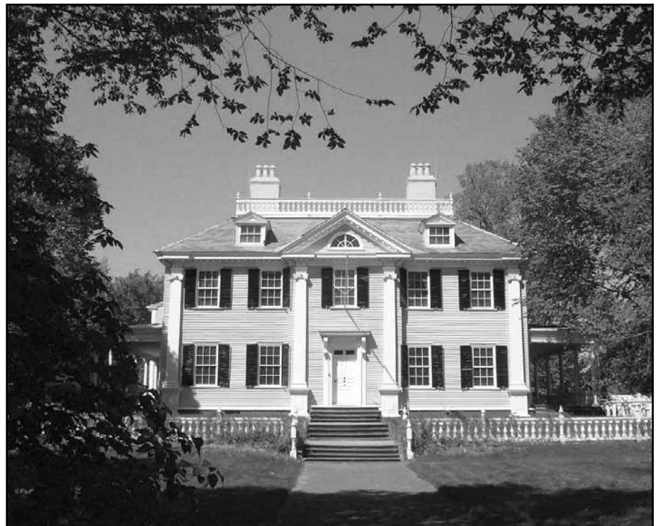
Exterior of Longfellow House, Cambridge, Mass.