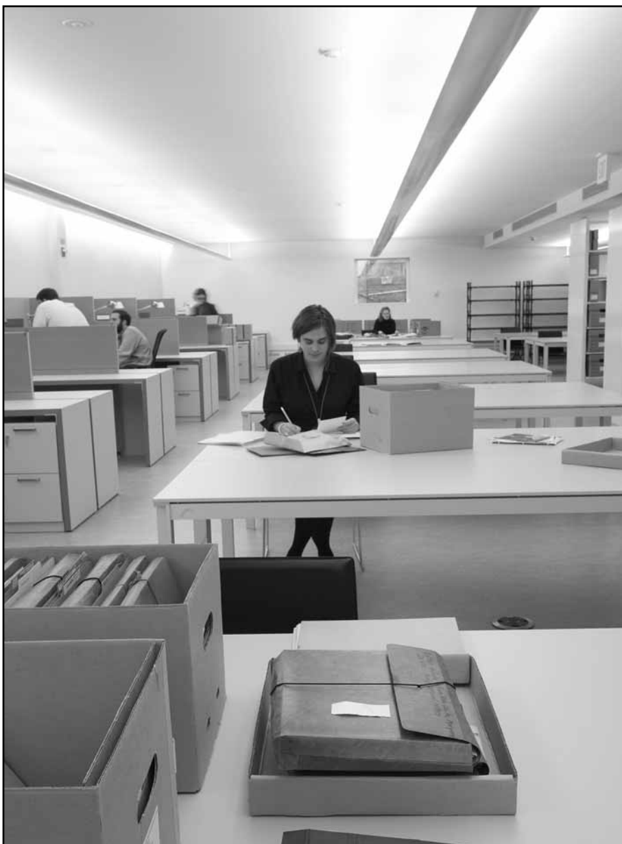
Archivists at work in the Beinecke Rare Book and Manuscript Library's new archival processing space.

There have, of course, been challenges. In ways both expected and unplanned, expanding into a second location has affected the way the unit functions on every level, from basic facilities concerns to work culture, workflow, access policies, strategic planning, processing methodology, documentation, and finding aid creation. In the off-site space, we are still waiting for final resolution on problems related to the HVAC system, telephone installation, and furniture. Good communication among staff based in two buildings requires regular face-to-face meetings (and thus a fair amount of walking), but a new blog that appears front-and-center on the unit's internal Web site makes it easier to stay on the same page. Preservation concerns and the library's vigilance on security issues make moving collection material to the new space, and back again when it is processed, a time-consuming procedure that involves a great deal of documentation. We move material once a month, with no exceptions, and we have made numerous changes to the unit's (and the library's) workflow due to this limitation. Several post-processing tasks, for