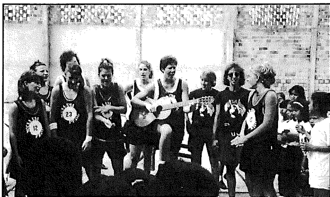
Known for their singing, the NCCAA women's team ministers through song in Iquitos, Peru.