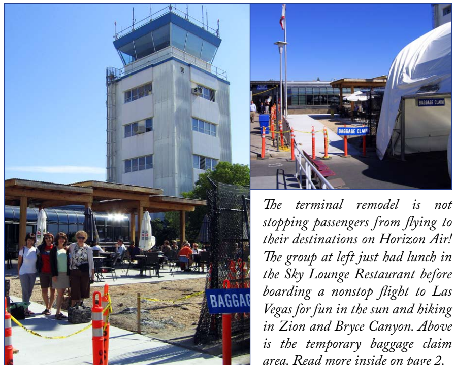
The terminal remodel is not stopping passengers from flying to their destinations on Horizon Air! The group at left just had lunch in the Sky Lounge Restaurant before boarding a nonstop flight to Las Vegas for fun in the sun and hiking in Zion and Bryce Canyon. Above is the temporary baggage claim area. Read more inside on page 2.