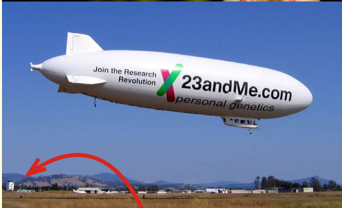
Sonoma County Airport Air Traffic Control Tower in the distance.