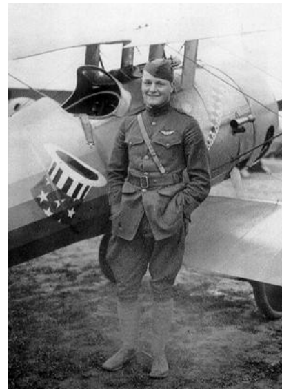
Eddie Rickenbacker and the original Nieuport 28.