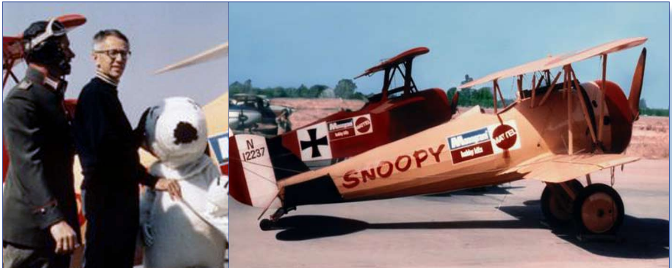
That's the Red Baron, Charles M. Schulz, and Snoopy at left in the early 1970s. What's the story on this historic aircraft and where is it now? Read all about it and more inside this edition of the Red Baron Flyer!