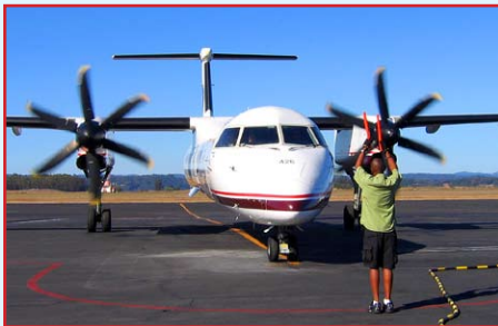
Horizon Air coming in for a landing!