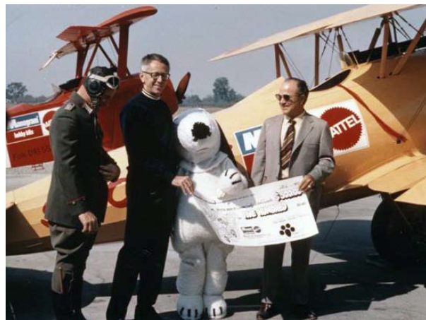
Early 1970s: The Red Baron, Charles M. Schulz, Snoopy, and an unidentified person.