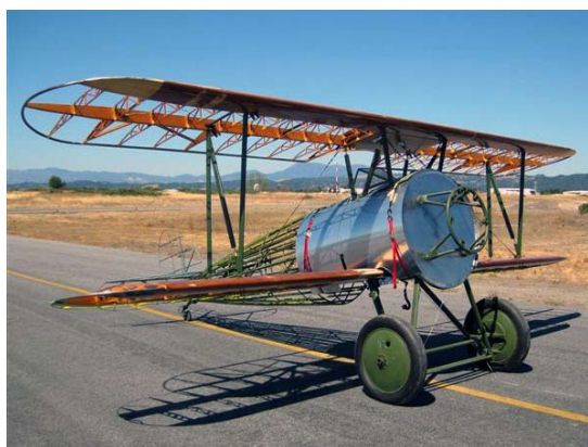
Brent's N28 as it looks today. Not quite fly-ready yet!

The N28 now sits in Brent's hangar waiting for skin to cover its bones, some rigging for the wings, and an engine to bring it back to life, but it's still a handsome thing that evokes its glamorous and gritty past.