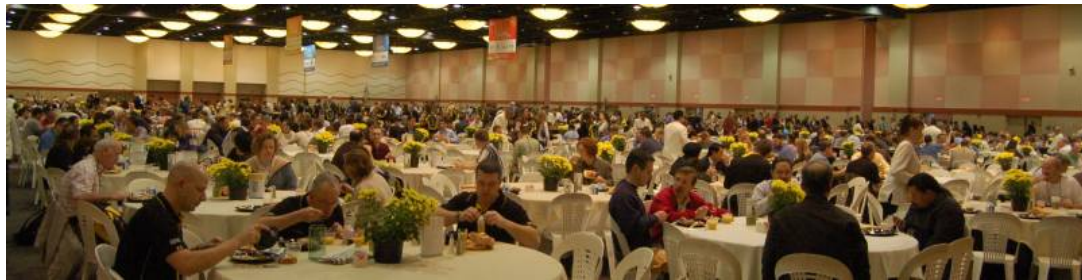
Lotusphere affords one the rare opportunity to have a quick breakfast with well over 10,000 of your closest Lotus-centric friends

Clearly IBM Lotus is on the move. It has products that are compelling and fit in the new Web 2.0 world. IBM is trying to gain a better position in the SMB market with new servers, software, and SaaS services. A few allusions to Microsoft were made. The bottom line is that these two companies are in a fierce competition in the Unified Communications space.