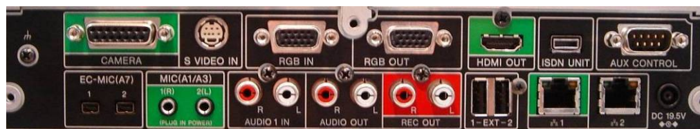
Rear panel of PCS-XG80