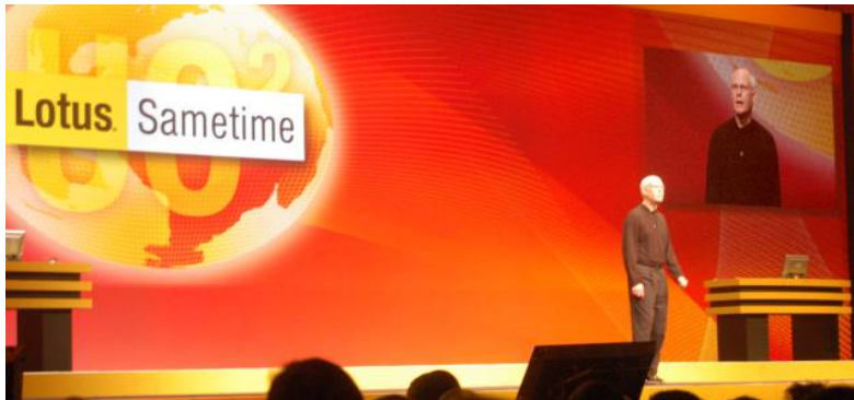
Bruce Morse, VP Unified Communications Software, Lotus Software, gives his annual Sametime state-of-the-union address in the big-tent

have had Sametime IM and presence built in and available to them. Net new full (paying) Sametime users has increased by about 4 million over the past two years, bring the total up to about 20 million paying customers. Furthermore, another 4.5 million have subscribed to Sametime Entry. IBM reported that approximately 1/3 of the new Sametime customers are in Microsoft Exchange environments, a fact that promotes IBM's vision of heterogeneity and multiplatform solutions.