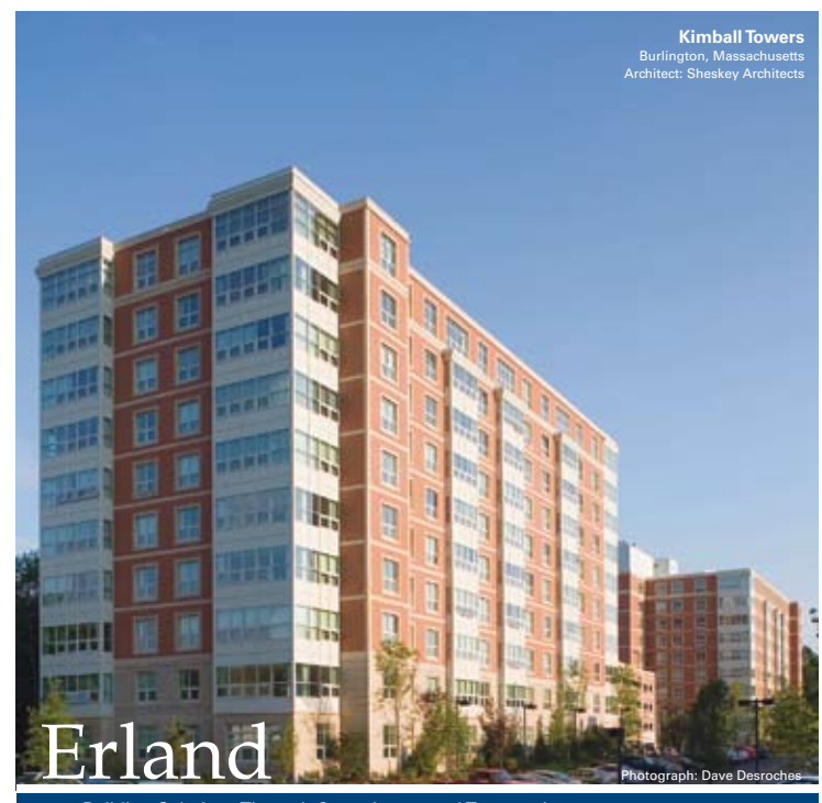
Building Solutions Through Commitment and Teamwork

Of the entirely new products, many are focused on energy abundance, efficiency, storage, and conservation. Products like nanoantenna photovoltaics that continue to work at night, and quantum dots that efficiently luminesce in a bright, visible spectrum of light, might eventually play a significant role in architecture. They are also good examples of recent advancements in optics/photonics research, which