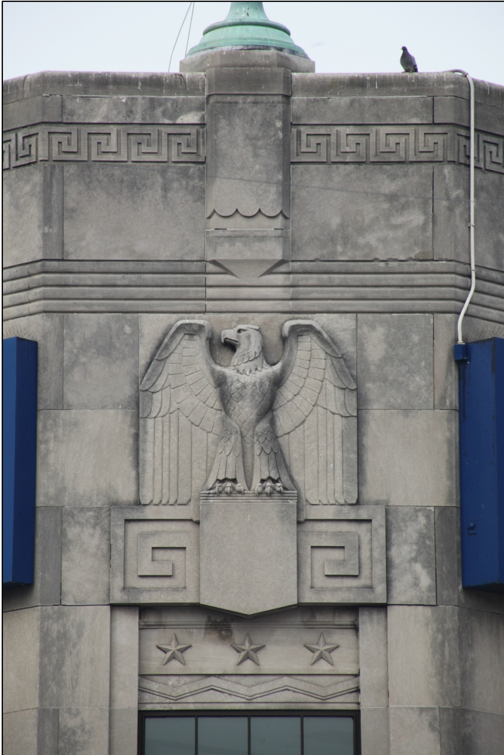
Jamaica Savings Bank Detail