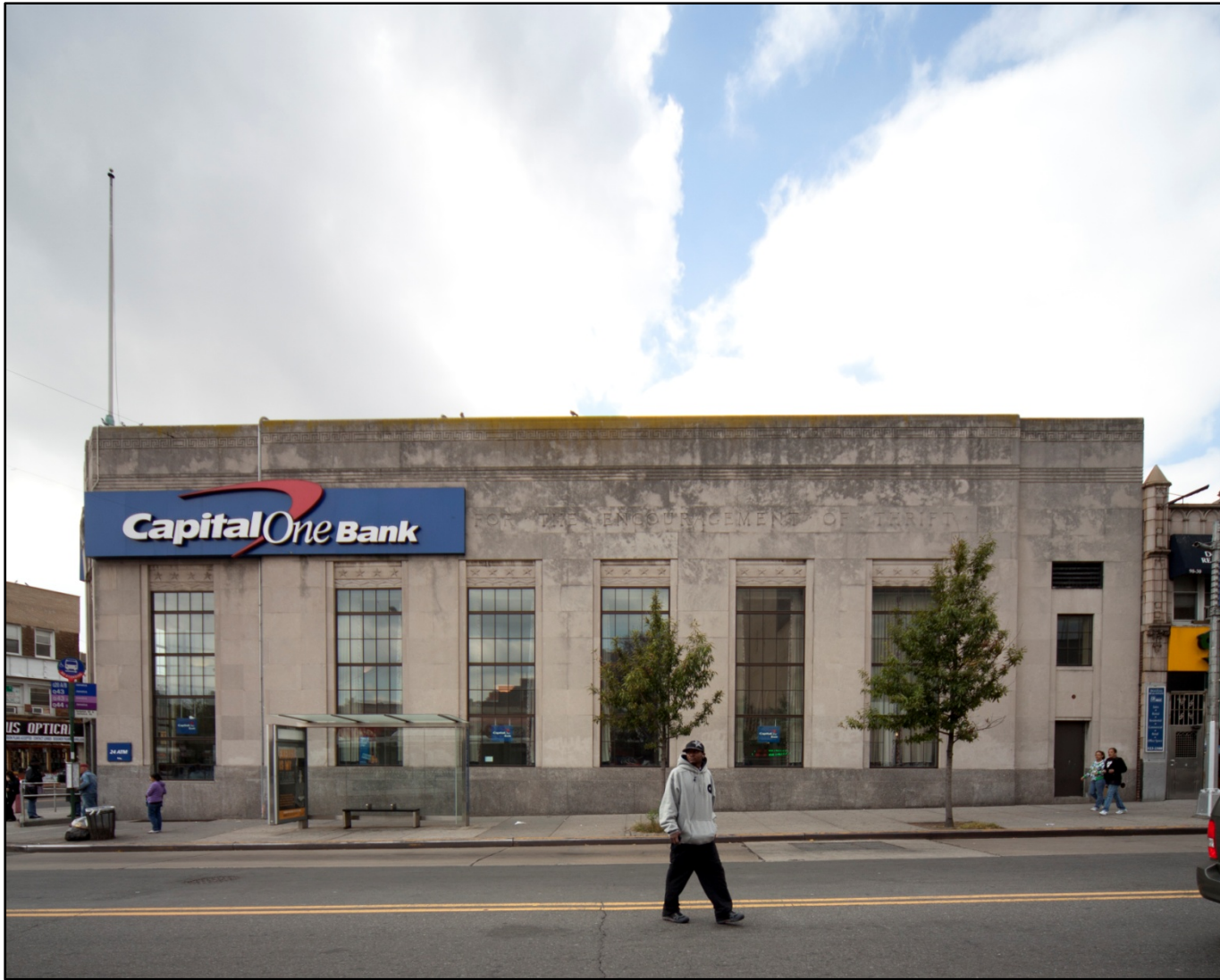
Jamaica Savings Bank Sutphin Boulevard facade