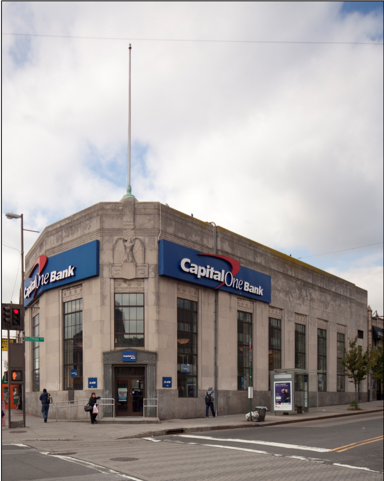
Jamaica Savings Bank 146-21 Jamaica Avenue (aka 146-19 to 146-21 Jamaica Avenue, 90-32 to 90-44 Sutphin Boulevard), Queens

Jamaica Avenue and Sutphin Boulevard facades