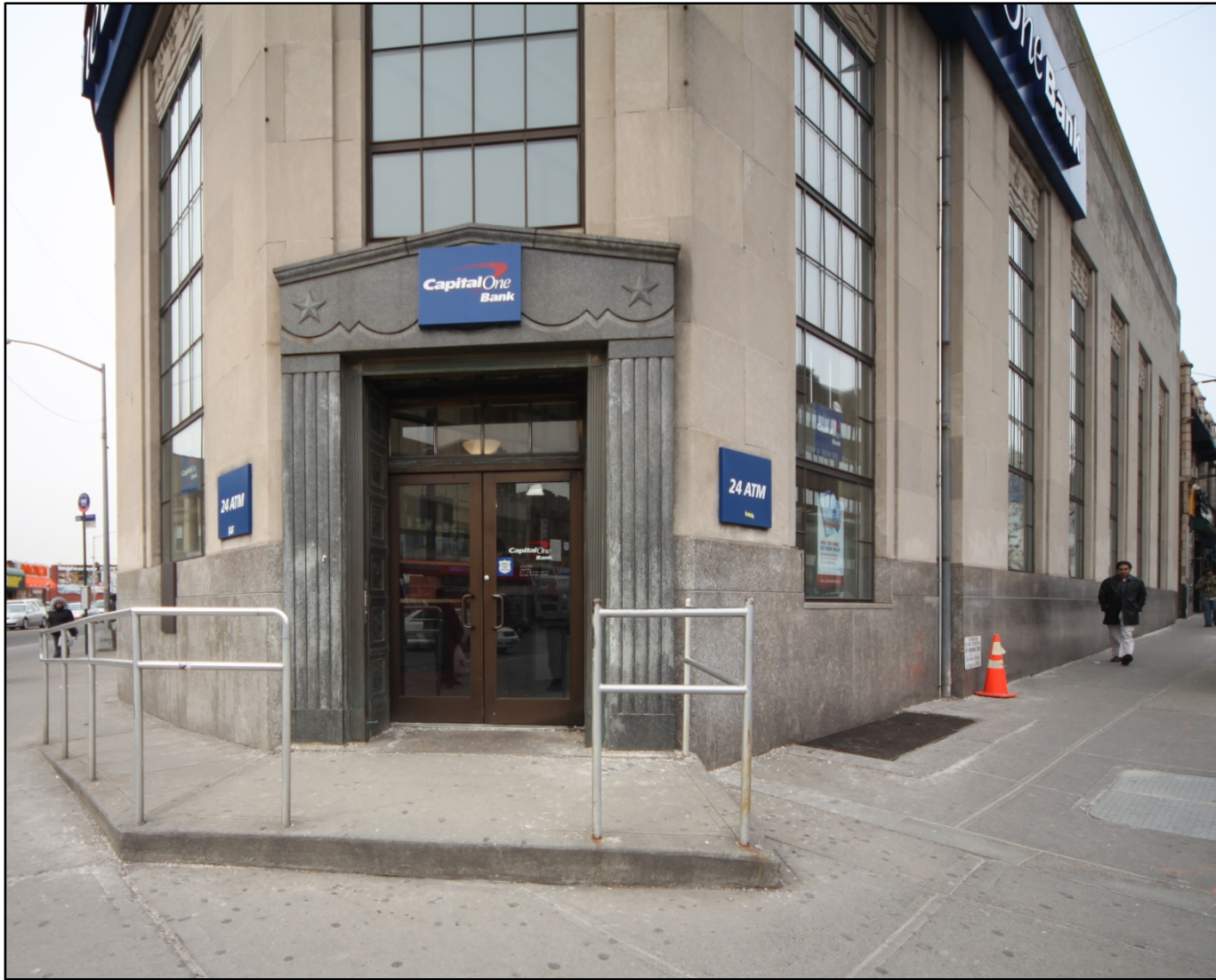
Jamaica Savings Bank Detail