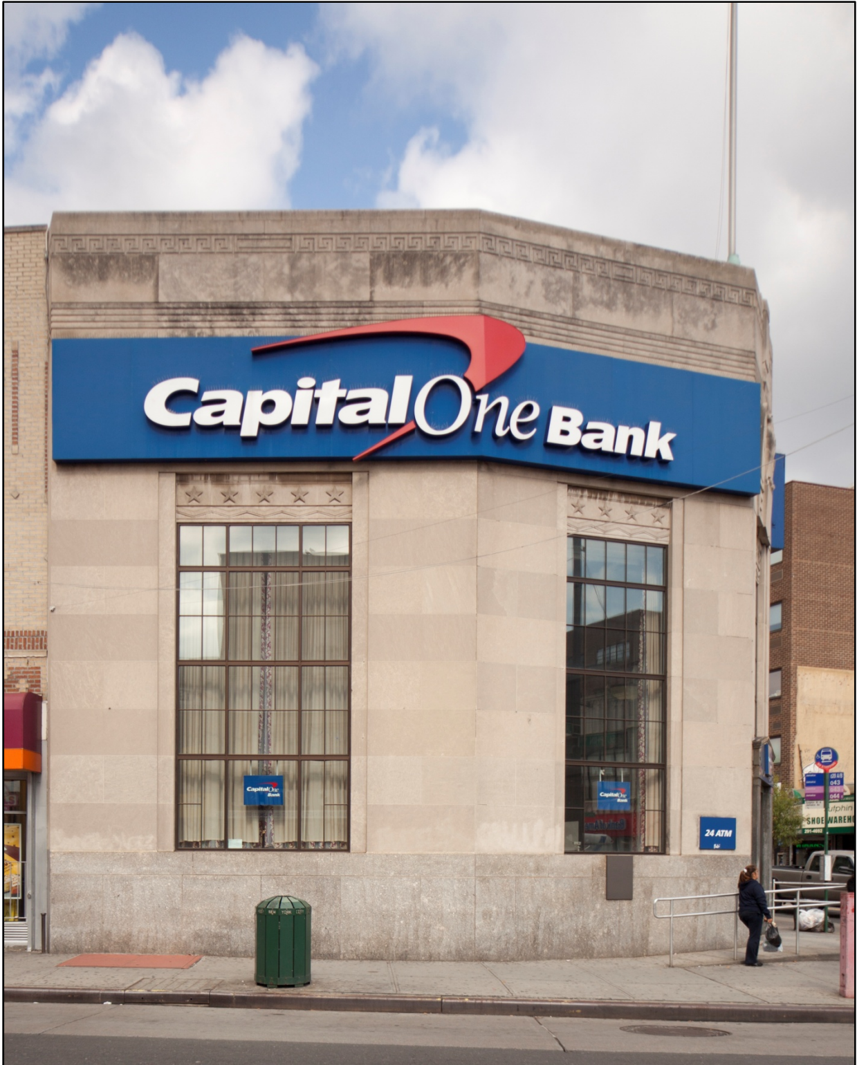
Jamaica Savings Bank Jamaica Avenue facade