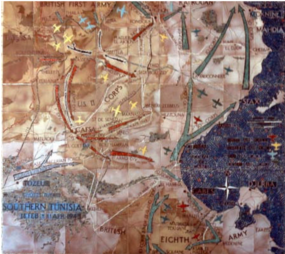
Map of Military Operations in Southern Tunisia