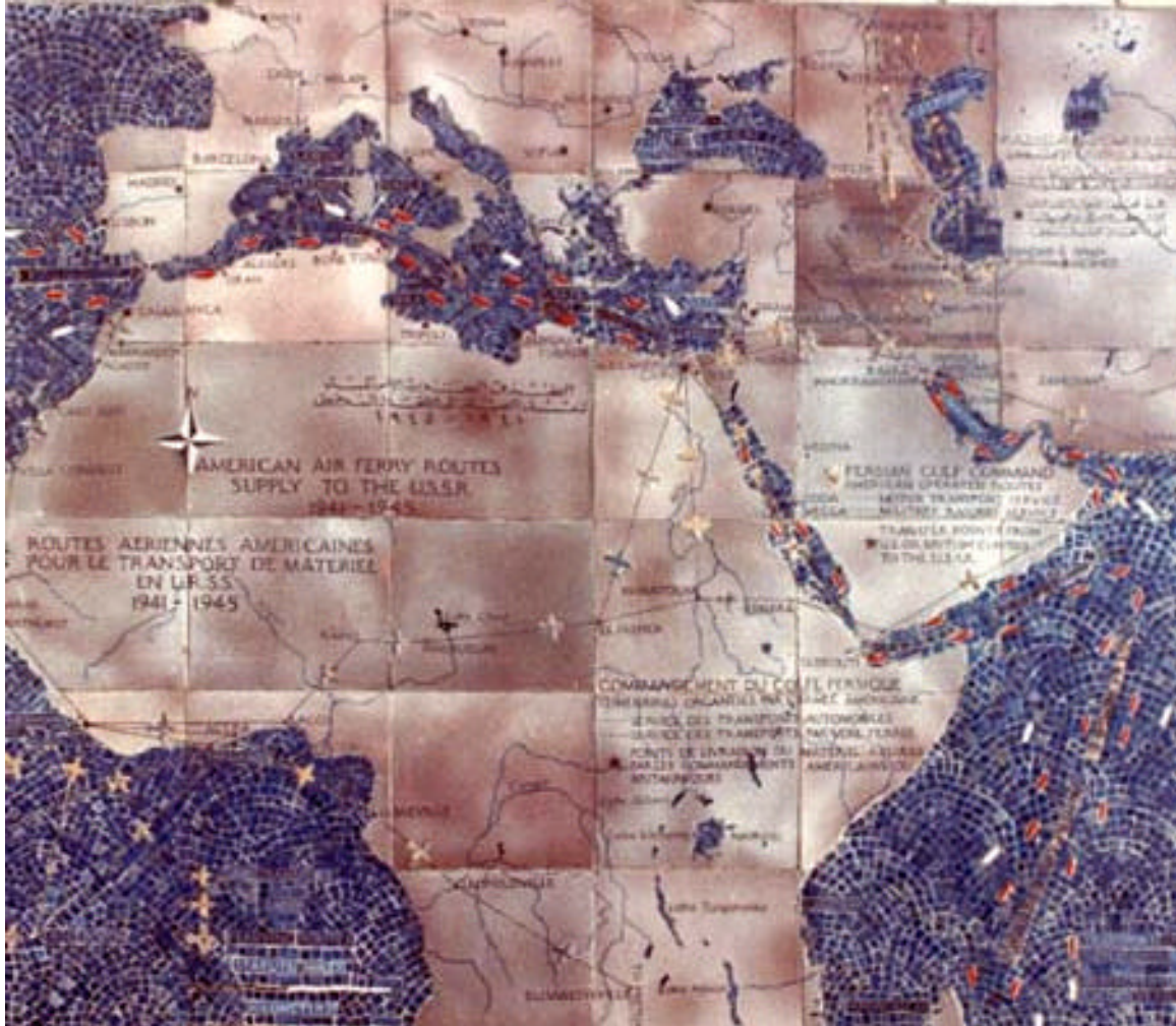
Map of Air Transport and Supplies to Russia

ON 8 NOVEMBER 1942, IN A MAJOR OPERATION COVERED BY NAVAL GUNFIRE AND AIRCRAFT, UNITED STATES AND BRITISH TROOPS WERE LANDED SIMULTANEOUSLY IN THREE WIDELY SEPARATED AREAS ON THE SHORES OF NORTH AFRICA. THE AMERICAN WESTERN NAVAL TASK FORCE, SAILING FROM THE UNITED STATES, LANDED AMERICAN TROOPS AT FEDALA, MEHDIA AND SAFI FOR THE ASSAULT ON CASABLANCA. OTHER AMERICAN UNITS ESCORTED FROM THE UNITED KINGDOM BY THE BRITISH CENTER NAVAL TASK FORCE WENT ASHORE NEAR ORAN AND IN TWO DAYS OCCUPIED THAT CITY. SHIPS OF THE BRITISH EASTERN NAVAL TASK FORCE, COMING ALSO FROM THE BRITISH ISLES, LANDED UNITED STATES AND BRITISH TROOPS NEAR ALGIERS WHICH WAS OCCUPIED THAT DAY. FOLLOWING THE LANDINGS, THE ALLIED NAVAL FORCES KEPT THE SEA LANES OPEN FOR AN UNINTERRUPTED FLOW OF SUPPLIES AND ALSO PROVIDED FIRE SUPPORT TO THE TROOPS ASHORE. ON 11 NOVEMBER AN ARMISTICE PROCLAMATION ENDED VICHY FRENCH RESISTANCE THROUGHOUT ALGERIA AND MOROCCO.