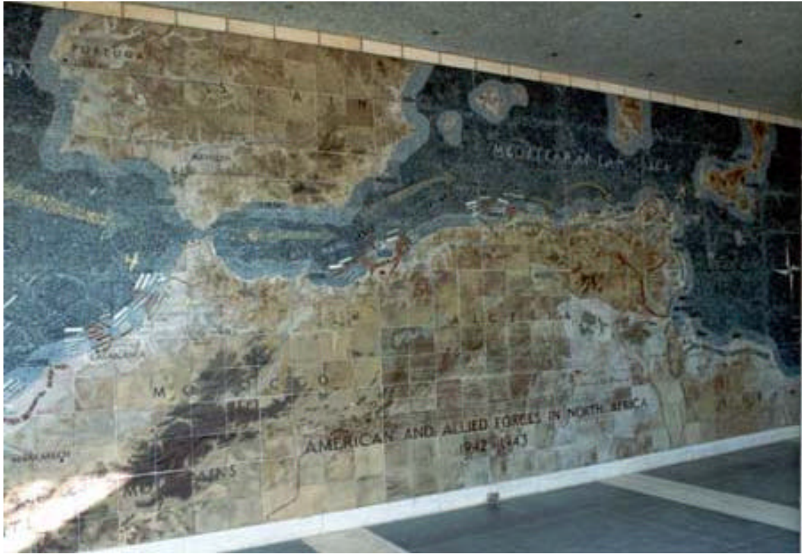
Map of American and Allied Forces in North Africa 1942-1943