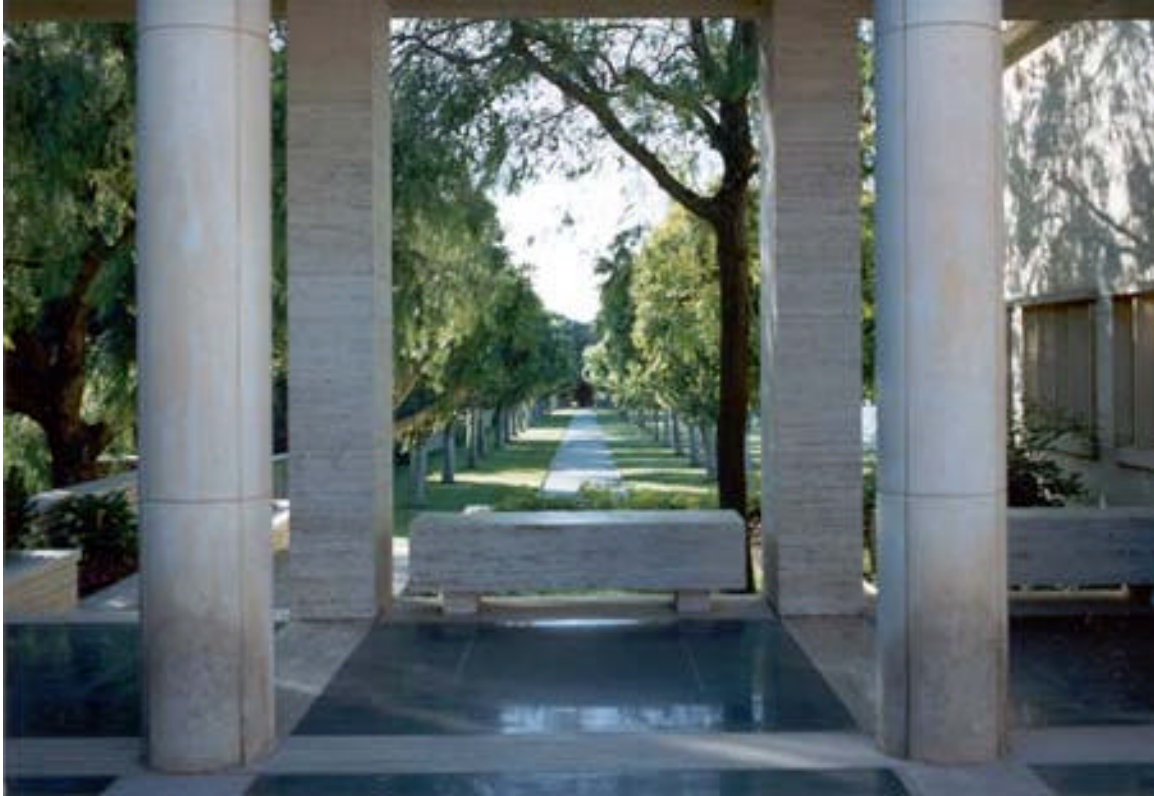
Cloister with Stone of Remembrance