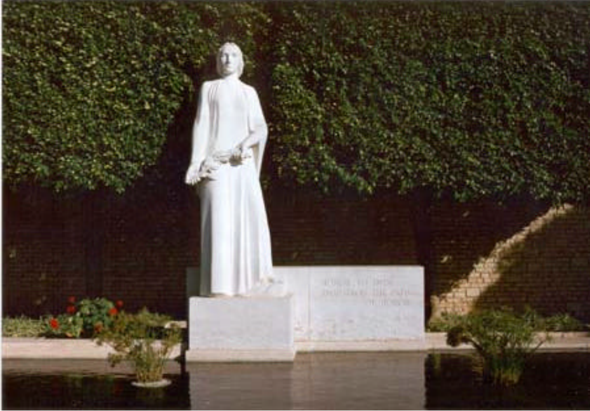
Statue of “Honor” by Reflecting Pool

ground and air resistance. When U.S. carrier planes joined the attack, Combat Command B drove northward toward Casablanca, halting only when it was informed that resistance had ceased. To the north, the 60 th Regimental Combat Team of the U.S. 9 th Division captured the Port Lyautey airfield late on 10 November, with the support of naval and armored units,