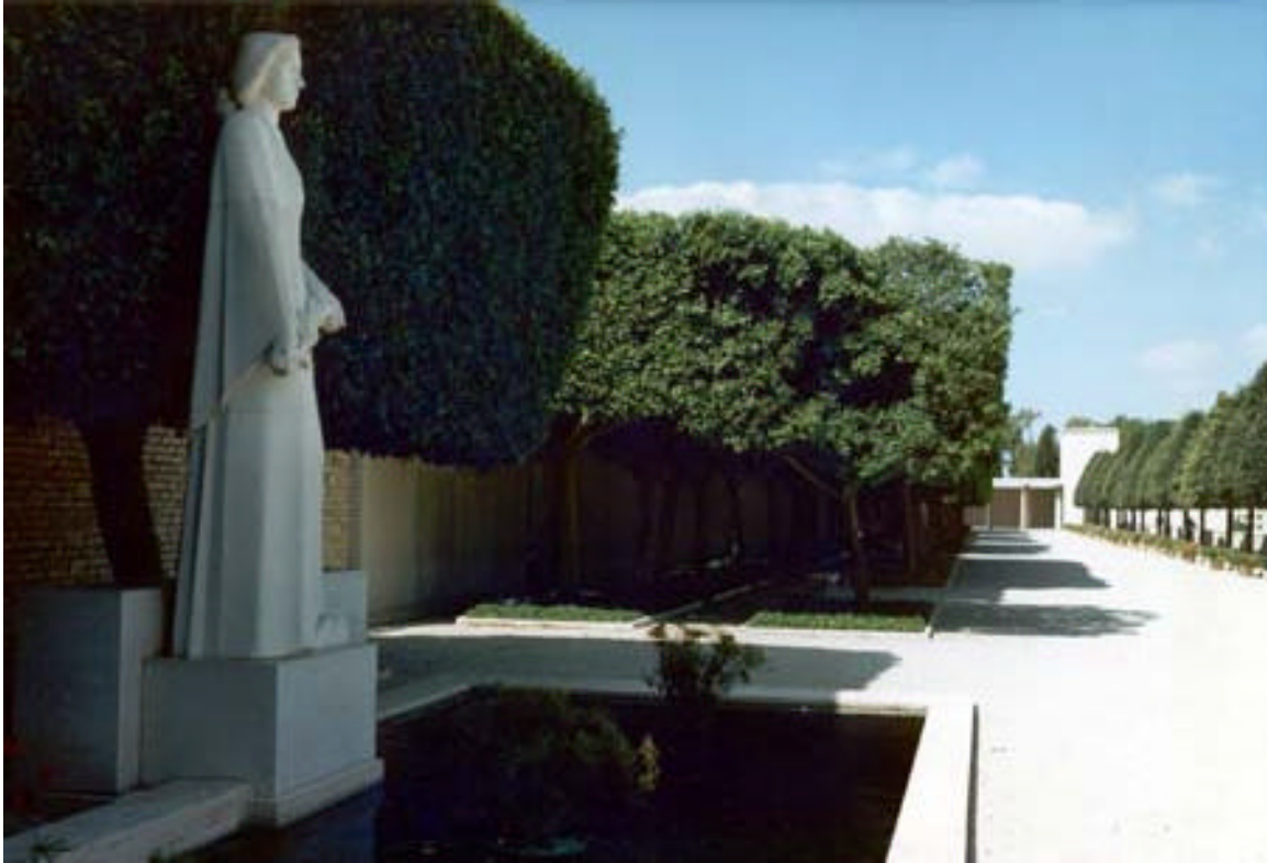
Tablets of the Missing with Statue of “Honor” in foreground