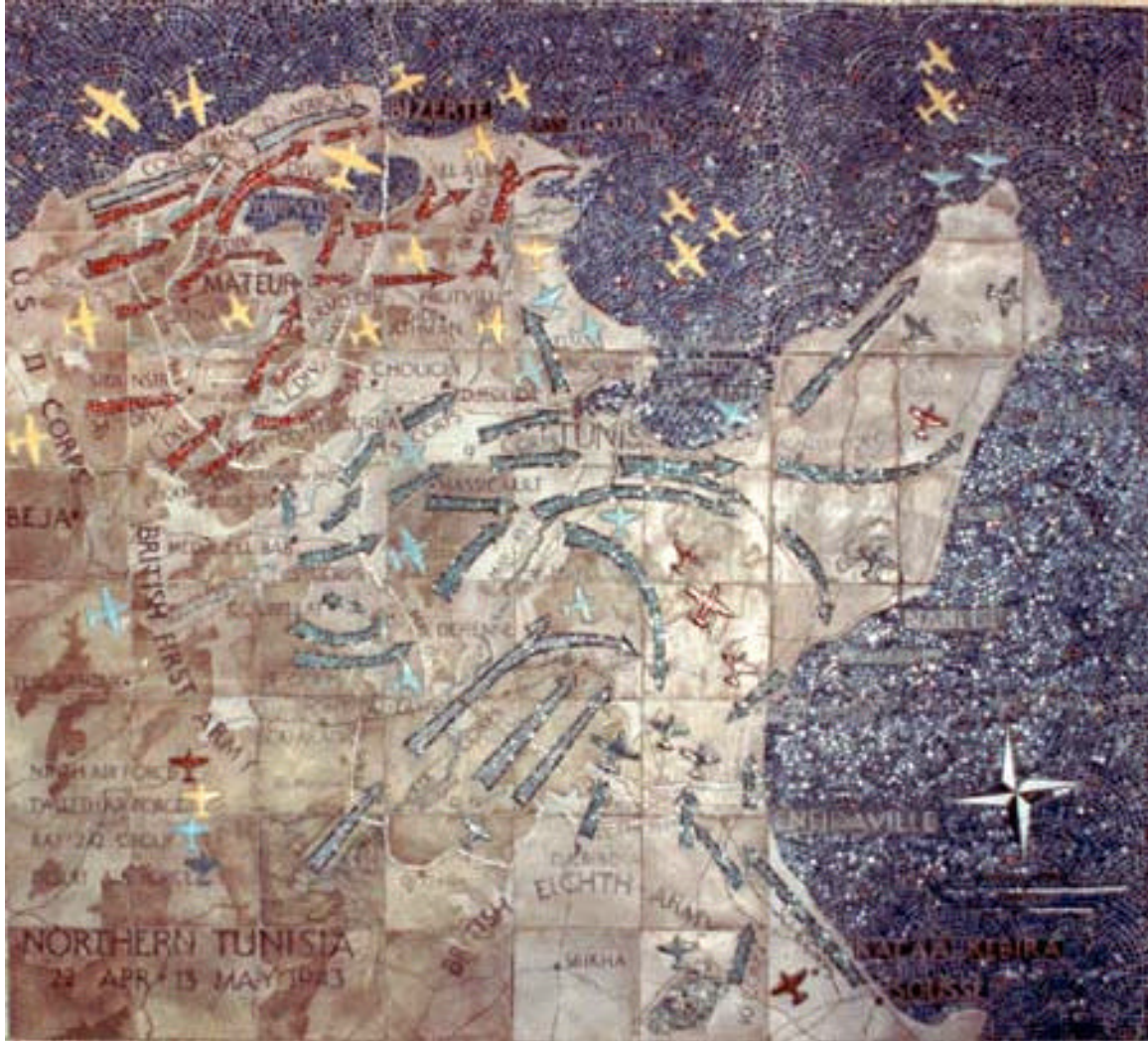
Map of Military Operations in Northern Tunisia