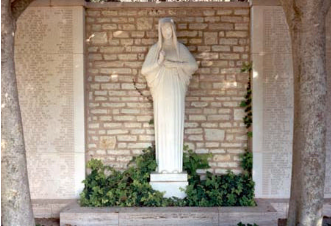
Statue of “Memory” by Tablets of the Missing

elements of the British 78 th Infantry Division. Opposition ended that same day, as orders from Algiers were issued to cease all hostilities in North Africa.