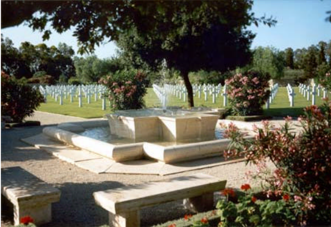
Oasis in Center of Graves Area